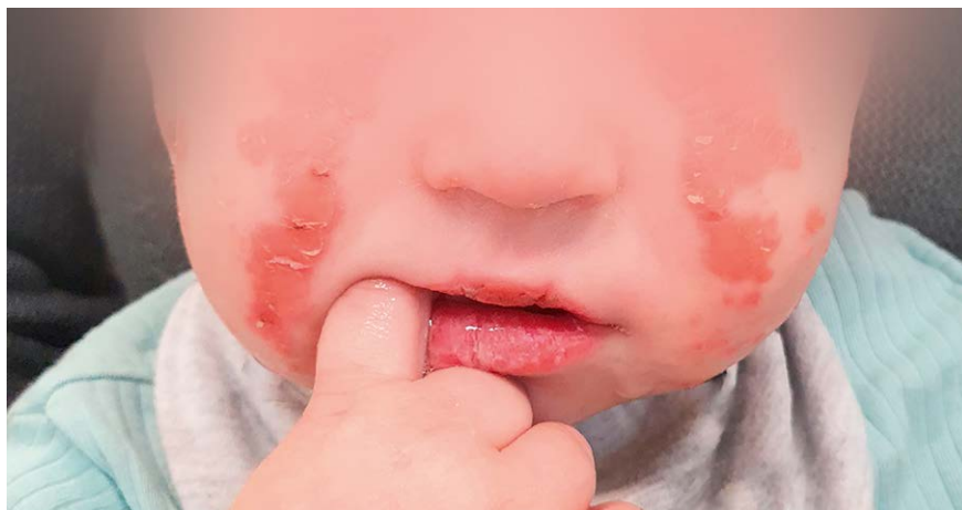
► Fig. 4 eruptions on face on day 17 after onset of symptoms (outpatient follow-up).

There is a substantial number of case reports and evidence available in the public literature, mostly published in the dermatological literature, of psoriasis triggered by KD in children and it is a well-known entity in the dermatology consortium. However, as of today it has not been broadly acknowledged by the paediatric community. With this case report, we seek to increase awareness amongst paediatricians. Parents may be reassured by the excellent long-term prognosis that differs from classic psoriasis.