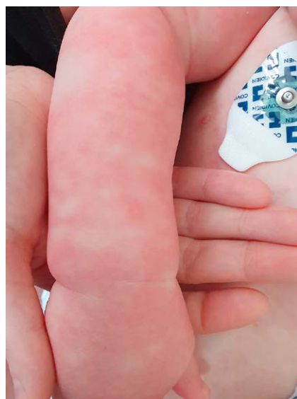
► Fig. 1 eruptions on face on day 17 after onset of symptoms (outpatient follow-up).

A 12-month-old boy who had been diagnosed and treated for classic KD around 2 weeks prior presented to our outpatient department on day 17 (day 1 = first day of fever) with nummular, erythematous and desquamating skin eruptions on his arms, legs and face. When he was admitted and treated for KD, he presented with pyrexia, a morbilliform rash and conjunctivitis evident since 4 days. In addition to the aforementioned symptoms, cracked lips were present (► Fig. 1 and 2 ). Biochemical and haematological parameters revealed a C-reactive protein of 112 mg/l, abnormal liver function tests (ALAT 2x upper norm), elevated NT-proBNP of 4473 pg/ml, anaemia (Hb 68 g/l) and an erythrocyte sedimentation rate (ESR) of 77 mm/1 h with normal platelets and no lymphopaenia. A nasopharyngeal aspirate PCR test was negative for respiratory viruses (including SARS-CoV-2). Serum SARS-CoV-2 IgG (anti-Nucleocapsid IgG and anti-Spike protein IgG) were negative. Echocardiography did not show any abnormalities. Fulfilling clinical criteria for complete KD, treatment with high-dose intravenous immunoglobulins (2 g/kg/dose) and high-dose oral acetyl salicylic acid (65 mg/kg/day) was initiated, and given his young age, intravenous methylprednisolone (2 mg/kg/day) was added. His clinical course was favourable and he defervesced within the first 24 hours after initiating KD treatment. On day 10 he was discharged on a weaning dose of oral prednisolone and low dose oral acetyl salicylic acid.