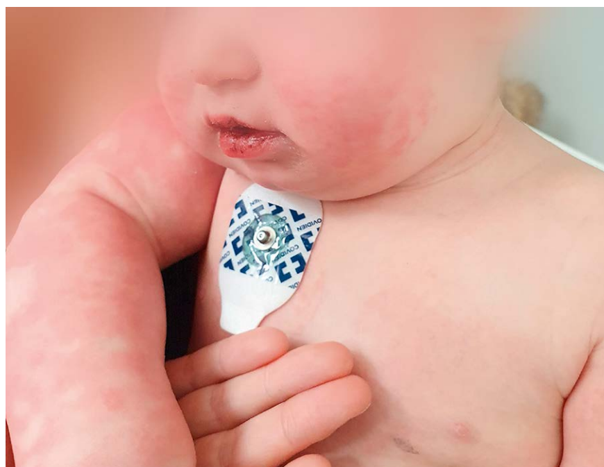
► Fig. 2 rash on face when admitted, day 4 of fever.