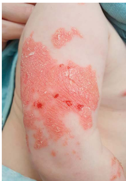
► Fig. 3 eruptions on upper extremity on day 17 after onset of symptoms (outpatient follow-up).

On day 17, when he was scheduled for a planned follow-up appointment in our outpatient department, he presented with well-demarcated, erythematous scaly plaques on his face and arms (► Fig. 3