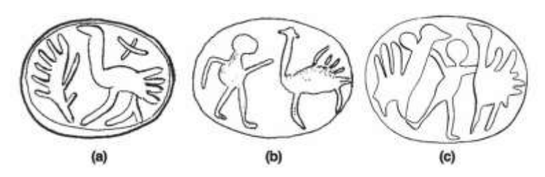
Figure 5 – Desert God

Source: (a) Beitin (KEEL, 2010a, p. 24, n. 12), (b) El-Jib (KEEL, 2013, p. 468, n. 5), (c) Nasbeh (KEEL, 1978, p. 104, n. 39).