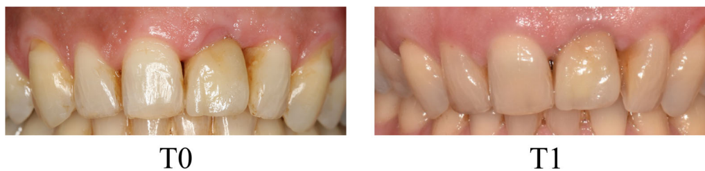
FIGURE 2 Female patient with a single implant-supported crown replacing the 21 with an important vertical discrepancy (0.9 mm) after an 11-year follow-up who is fully satisfied with the aesthetic outcome of the treatment and did not perceive any changes during time.

implant restorations. Multiple studies showed that implant restoration was rated more satisfactory than peri-implant mucosa (Cosyn et al., 2012; den Hartog et al., 2013; Meijndert et al., 2007). Our results fall in the same range and proportion, patients were also more pleased with the implant restoration (Q6, mean: 3.9) than the soft tissue (Q7, mean: 3.3). The subjective aesthetic evaluation made by the patients was confirmed by the calculated PES/WES. The general PES at long-term evaluation was acceptable (mean: 6.69, SD: 1.7). A previous study (Belser et al., 2009) found a mean of 7.8 \pm 0.8 but the follow-up period was shorter (2–4 years), which may explain the difference in our results. In our study, the PES/WES was evaluated by an orthodontist, who has been shown to be clearly more critical than other professional observers (Fürhauser et al., 2005). In our sample, the patients who had noticed a change in the height of their gingiva during time were those that had significantly lower PES scores.