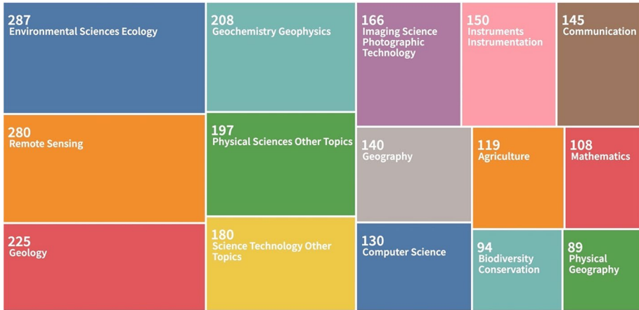
Fig. 2 Scientific subjects of the publications on African countries using Sentinel-1 or Sentinel-2 satellite images (the numbers refer to the number of publications classified in each research area, according to Web of Science, one publication may be classified in several areas of research)

NET, Africa regional centres, African Union, EU, UN-SPIDER, Group on Earth Observations, Collaborative Research Programs, multilateral and bilateral aid projects. This finding buttresses the fact that although publications utilising EOPS in an African context are increasing, these publications are not necessarily led by researchers in Africa-based research institutions or universities. However, as shown by similar studies related to climate change, there is an increase in first and co-authorship originating from the continent (Kapuka et al. 2022). This is also in line with the findings of Kumar and Mutanga (2018), which identified very few GEE-based studies from developing countries, in particular, even lesser on Africa or by Africa-based researchers. This reflects the limited access to the technology and inadequate human capability despite that the EO datasets are freely available.