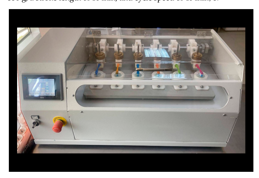
Figure 2. Toothbrushing simulation device used in the study.

To evaluate the effects of toothbrush abrasion and different kinds of toothpastes on the surface properties of the interim crown materials, specimens from each material group were divided into 4 subgroups by using a simple randomization technique (n = 10). While no toothbrushing was applied to the control group specimens (Cnt), the specimens of the 3 test groups were subjected to toothbrushing using a simulation device (DentArge TB-6.1, Analitik Medikal, Gaziantep, Turkey) for 10,000 cycles, which corresponds to 1 year of toothbrushing (Figure 2) [13]. The test groups consisted of a toothbrush (Banat Basic Medium, Banat Co., Istanbul, Turkey) and distilled water (Dw), a toothbrush and whitening toothpaste (Signal White Now, Unilever)-distilled water slurry (1:1) (WTp), and a toothbrush and activated charcoal toothpaste (Splat Blackwood, Splat Cosmetica, Moscow, Russia)-distilled water (1:1) slurry (ACTp). For each specimen, a new toothbrush and fresh slurries were used. The brushing action was performed at room temperature (25 °C) in a back-and-forth direction, and the standardization was achieved with a vertical force of 350 g, a stroke length of 10 mm, and cycle speed of 40 mm/s.