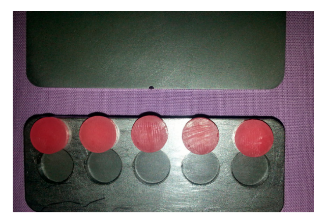
Figure 1. Stainless-steel mold used in the study and disc-shaped wax patterns for CadPM specimens.

Ten specimens per group were deemed appropriate from the calculations through ANOVA for the independent groups, with a 95% confidence (1-\alpha) , 80% test power (1-\beta) , and f=0.27 (for surface roughness) and f=0.44 (for color) effect sizes. Forty disk-shaped (10 mm in diameter and 2 mm in thickness) specimens were prepared from each interim crown material. The mixing and polymerization processes of the Tab 2000 (ChPM), Imident (LaPM) and Protemp 4 (ChDM) specimens were carried out in a stainless-steel mold according to the manufacturers' instructions. A disc-shaped (10 mm \times 2 mm) wax pattern was scanned (Trios 3, 3Shape Inc., Copenhagen, Denmark) and the standard tessellation language (STL) data were transferred to a computer-aided design (CAD) software program (Ceramill Mind, Amanngirrbach AG, Koblach, Austria) for the fabrication of the CadPM specimens (Figure 1). The CadPM specimens were manufactured using a 5-axis milling machine (Ceramill Motion 2, Amanngirrbach AG) from Telio-CAD blocks.