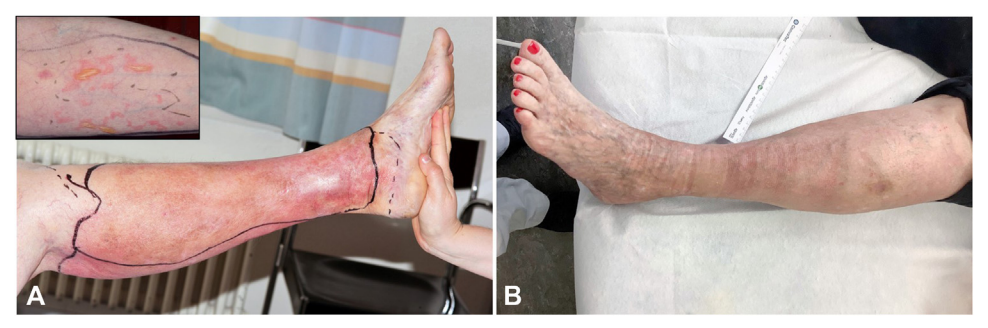
Fig 3. A , Painful swelling and redness in the left leg, warm and tender to touch, mimicking an erysipelas or a cellulitis associated with systemic symptoms and fever (temperature up to 40 °C). Erythematous papules and plaques with pseudobullous appearance on the left forearm (Inset). B , Complete regression of the clinical signs and the inflammatory syndrome after treatment with oral prednisolone. Signs of chronic venous stasis with varicose veins and pigmentation can be recognized.