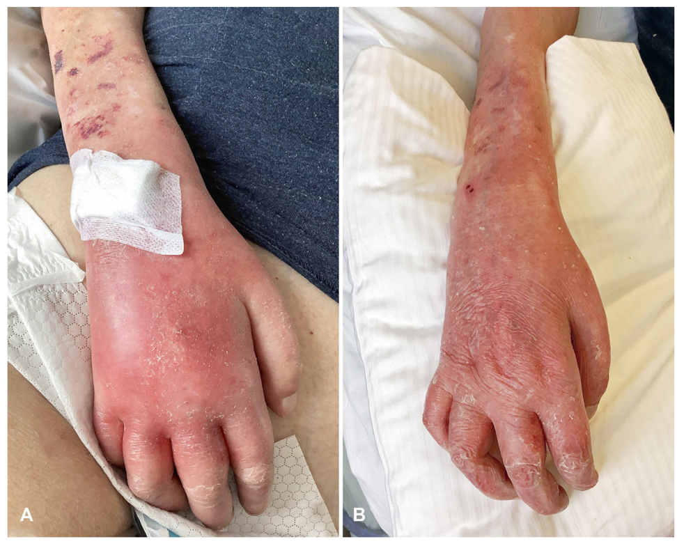
Fig 1. A, Symmetric acral involvement with an acute painful erythematous swelling of the dorsal surface of hands and fingers. B, Quick regression of the inflammatory syndrome and peripheral edema 5 days after treatment with topical clobetasol proprionate cream, empirical intravenous antibiotics, and protein-rich nutrition.