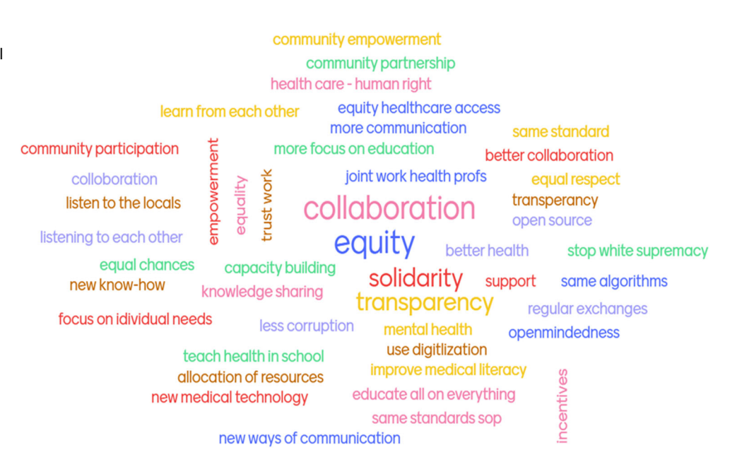
Fig. 2 Answers to the mentimeter question "Global health/surgery: What do you want for the future? What do colleagues from lower-resource settings want?" Sample: 42 students from the course "Global Health and Humanitarian Work" at the Medical University of Vienna. participants gave at least one answer, which are depicted in a word-cloud format. Answers that were mentioned more frequently are increased in size

ties should be strengthened. We need fair, reciprocal, and equitable partnerships for young scholars regardless of their resources. For global surgery, hospital work needs flexibility and, in order for global health and its branches to unfold and reach their full potential, time and energy are required. This mostly exceeds an out-of-hours "leisure" commitment and, as a result, dedicated residency programs have emerged [40].