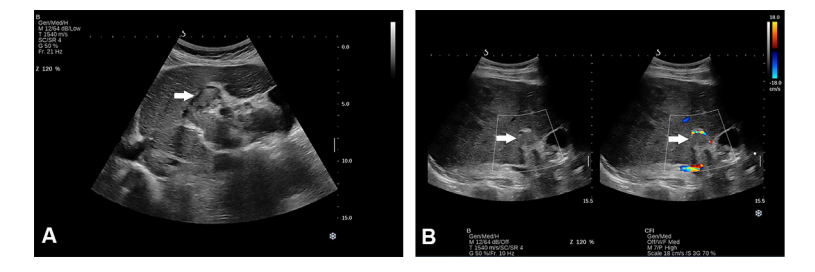
Figure 4. Thrombosis of portal vein (main, right and left branch) in a 62-year-old man recently diagnosed with NASH-related cirrhosis in B mode (A) and Doppler mode (B).

To improve the imagining surveillance, the American College of Radiology (ACR) released the Ultrasound Liver Imaging Reporting and Data System (US LI-RADS) algorithm in 2017^{[30]} . According to the LI-RADS algorithm, the size determines the following steps to diagnosis. Lesions measuring less than 1 cm are challenging to be accurately characterised, regardless of the imaging method. Hence, cross-sectional imaging is not required, and short-term follow-up with repeat ultrasonography after 3-4 months is sufficient. If the tumour remains unchanged after two years of surveillance, malignancy is excluded, and the patient returns to the normal screening program. For lesions \geq 1 cm in diameter, either quadruple-phase CT or dynamic contrast-enhanced MRI should be performed to establish the diagnosis [11,12].