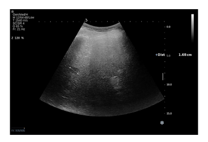
Figure 2. Conventional US revealed a hypoechoic lesion in segment VII in a 71-year-old man with non-alcoholic liver cirrhosis. Ultrasound attenuation can be observed in deep segments. The lesion was a hepatocellular carcinoma.