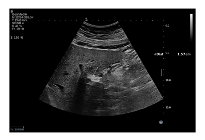
Figure 3. Conventional US revealed an isoechoic lesion with a hypoechoic halo in a 23-year-old woman diagnosed with non-alcoholic liver steatosis (arrow). CEUS examination followed, and, based on the contrast behaviour, the final diagnosis was focal nodular hyperplasia.