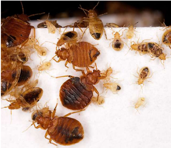
Fig. 6 Bed bugs ( Cimex lectularis ).

travel long distances, for example, in suitcases [65]. The bed bug's bite usually occurs at night and is not noticed at first due to the anesthetic effect of its saliva.