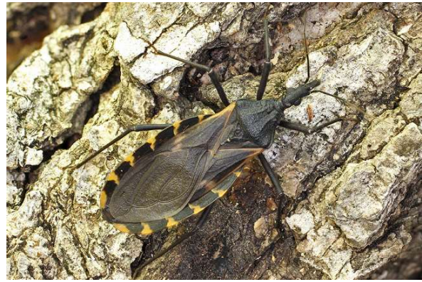
Fig. 7 Assassin bug ( Triatoma gerstaeckeri).

Triatomine insects (also called: kissing bugs, Mexican bed bugs, and cone-nosed bugs) are found mainly in the western and southern United States, Central