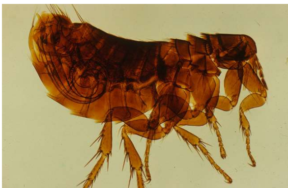
Fig. 9 Cat flea ( Ctenocephalides felis ).

Fleas are small blood-sucking ectoparasites [89] and include more than 2500 species. Fleas play an essential role in veterinary medicine since they frequently lead to allergic flea dermatitis in cats and dogs (FAD) [89]. The common cat flea ( Ctenocephalides felis felis ) is mainly responsible for the development of allergic flea dermatitis ([90]; Fig 9). Albeit rarer, flea allergic dermatitis can also manifest in humans, especially those more commonly exposed to ectoparasites, e.g., homeless people [91]. After a flea bite, the components of flea saliva (polypeptides, phosphorus, amino acids, aromatic amines) cause severe pruritus and papules, crusts, and excoriations [92]. In veteri-