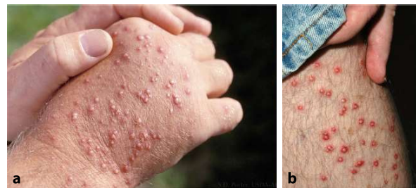
Fig. 2 Sterile pustules on hand (a) and leg (b) after fire ant sting.

The diagnosis of immediate-type hypersensitivity to ants is made by correlating the clinical manifestations of the sting reactions with ant-specific IgE determined by skin testing and/or radioallergosorbent test. Major protein allergens were isolated from IFA venoms (Sol I 1-4) and several allergens from other Solenopsis species (Sol g2-4 from Solenopsis geminata , Sol r2-3 from Solenopsis richteri , and Sol s2-3 from Solenopsis saevissima ), the Australian jack jumper ant (Myr p1-3, Myrmecia pilosula ) and the Asian needle ant (Pac c3, Pachycondyla chinensis ) [8]. Whole-body extracts contain relevant venom allergens and can be used for skin testing and immunotherapy for IFA allergy, Jack jumper ant allergy, Chinese needle ant allergy, and Samsun ant allergy ([18–22].