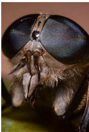
Fig. 5 Pale giant horse-fly ( Tabanus bovinus ).

back of the head by an insect while bathing in a lake in Switzerland. She identified the insect herself as a horse-fly. Minutes after the sting, severe itching occurred on the head, spreading rapidly to the whole body. Generalized urticaria and angioedema in the facial region quickly appeared, followed by hypotension (80 mmHg, systolic) and bradycardia. Emergency treatment consisted of intravenously administered epinephrine, volume administration, antihistamines, and systemic steroids. The tryptase in the acute event was 14.4 µg/l, the basal value measured later was 4.6 µg/l. Skin test solution for tabanids was not available, specific IgE against horsefly (0.45 kU/l) was positive, and thus the diagnosis of anaphylaxis following a horsefly sting was made.