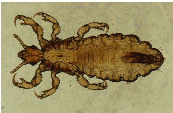
Fig. 8 Head louse ( Pediculus humanus capitis ).

a widespread infestation, especially in children. Few allergic reactions to head lice have been described, including one case of allergic asthma and one case of nasal and ocular allergy induced by a specific IgE-mediated reaction to louse body proteins [86–88]. To date, no allergic reactions to the body or pubic lice have been reported.