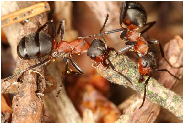
Fig. 3 Red wood ant ( Formica rufa ).