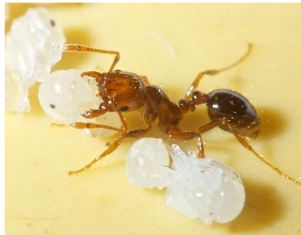
Fig. 4 Red fire ant ( Solenopsis invicta ).

The following two cases of ant allergy stem from the outpatient department in Zurich [7, 23]: