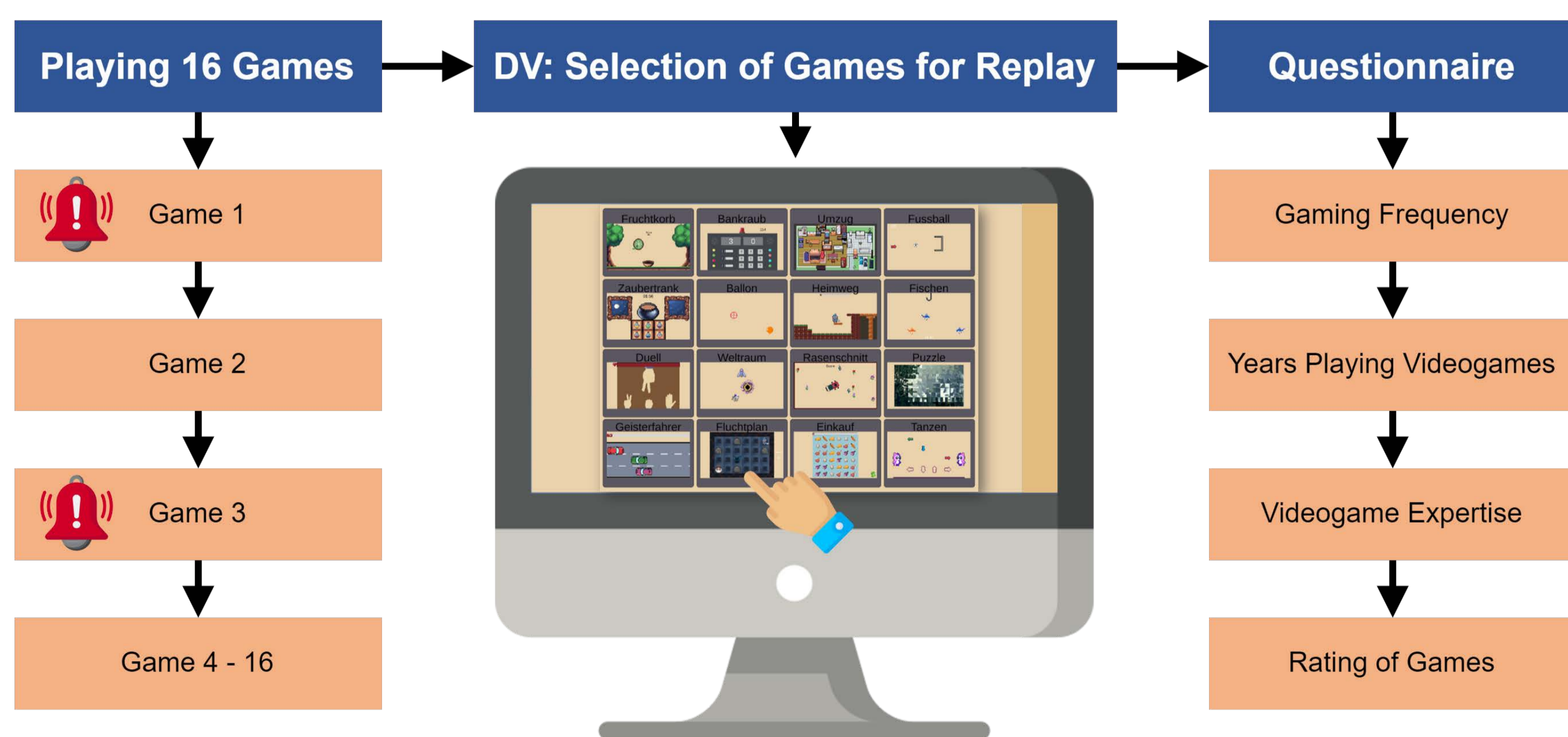
Figure 1. Graphical representation of the methods used in this study. The red bell symbolises an interrupted game. After playing the 16 videogames, all games were presented in a 4x4 matrix for participants to select from.

We tested N = 96 participants ( M_{age} = 29.99 , SD_{age} = 15.68 ), of which 33 identified as male (34.38%) and 63 identified as female (65.62%).