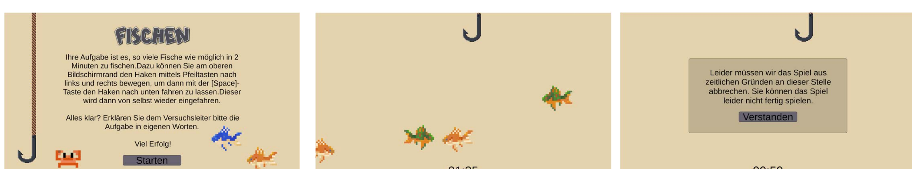
Figure 3. Example of the procedure for each of the 16 games played using the game “Fishing”. After an introduction, participants either finished the game or were interrupted halfway through reaching the goal of the game.