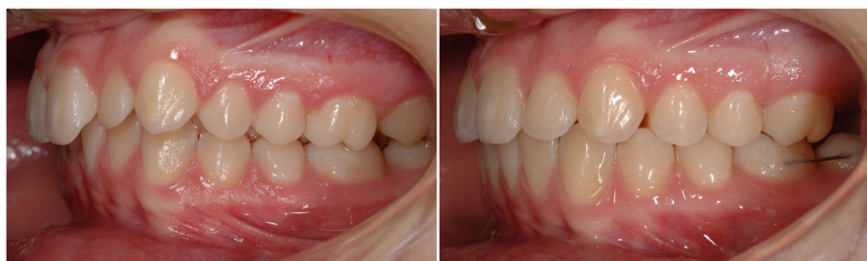
Figure 2 A case-report representing the initial and final occlusion after the treatment; note the post-treatment retention between lower first and second molar awaiting the upper third molar eruption.

Full-size DOI: 10.7717/peerj.14537/fig-2