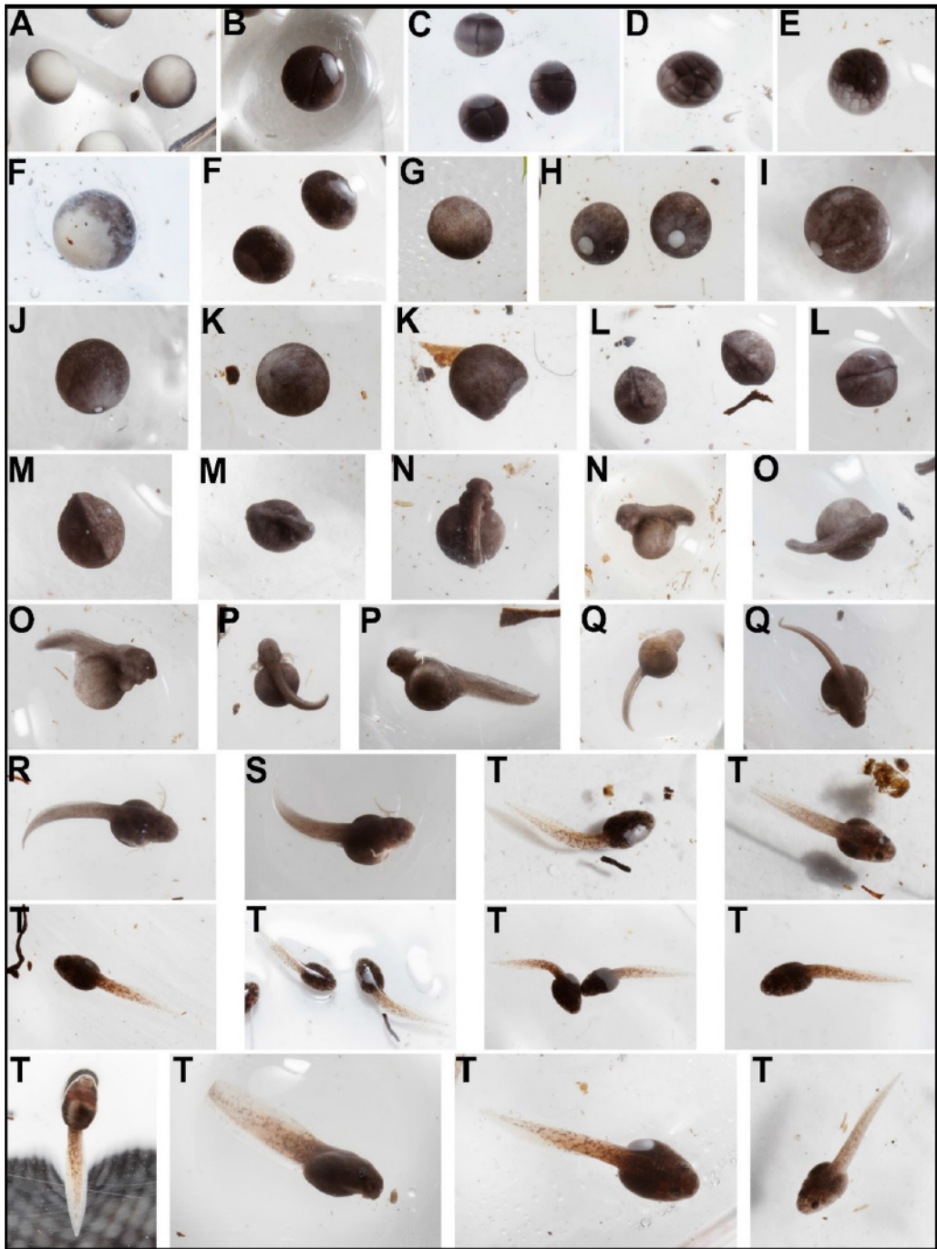
Figure 2. Pictures of the embryonic development of Allobates femoralis . For each picture, the day of development, the principal embryonic changes and the embryonic stages equivalent to Gosner (1960) are given. A–G: days 1–2. fertilisation and cleavage (stages 1–9); H–I: days 2–3. mid-gastrula (stages 10–11); J: days 2–3. late gastrula (stage 12); K: days 3–5. neural plate (stage 13); L: days 4–5. neural folds (stage 14); M: days 4–5. neural tube (stage 16); N: days 5–6. tail bud and mouth (stage 17); O: days 6–8. muscular response and ridges (stage 18); P–Q: days 7–13. external gills (stages 19–20); R–S: days 9–14. comea and fins become transparent, full development of external gills (stages 21–22); T: days 14–21. changes in pigmentation, disappearance of external gills, oral disc and labial tooth development (stages 23–25).