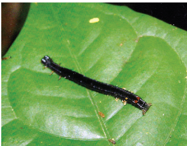
Figure 1. Photograph of the Achaea caterpillar (early to mid instar, dorsal view)—here seen resting on an unidentified heterospecific plant in the forest understorey—that was active in the crowns of Tetraberlinia korupensis trees in Korup National Park, Cameroon.

After consulting with lepidopterists (Dino Martins and Scott Miller pers. comm.), it was confirmed to be a noctuid moth, specifically an Achaea sp. It is most likely A. catocaloides Guenee—if not, the similar-looking outbreaker A. lienardi Boisduval—in the family Erebidae, superfamily Noctuoidea ( http://www.afromoths.net/species/show/33376 ; De Prins and De Prins 2011–2021), whose larvae could also be heard feeding and climbed silk threads as they defoliated many mature trees of the monodominant tree Paraberlinea bifoliolata Pellig. (Fabaceae) in Gabonese rainforest (Maisels 2004). Present across tropical Africa, A. catocaloides larvae are highly polyphagous, being not only known pests of various crops (Latham et al. 2022), including cacao in Cameroon (Dejean et al. 1991), but also commonly found on the legume forest trees Pentaclethra macrophylla Benth. (Eluwa 1977) and P. eetveldeana De Wild. & T. Durand (Latham et al. 2022), whose pinnate leaves are morphologically very similar to those of T. korupensis (and M. bisulcata ). Nevertheless, since the early instars of A. lienardi could also appear black ( https://www.inaturalist.org/observations/12672762 ) and its distinguishing morphological diagnostics vis-à-vis A. catocaloides are still unresolved, we cannot discount the possibility of mixed co-occurring populations of these two Achaea species being responsible for the outbreak in Korup.