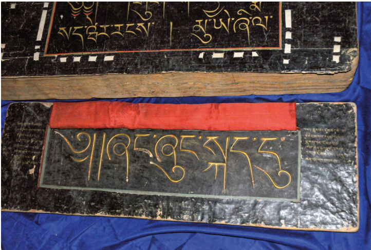
Fig. 2: Ornamental calligraphy leaves of a manuscript Khams chen , c. 22 × 60 cm, mthing shog blue paper with raised gesso and gold pigment, and red silk cloth cover for protection. Phijor, 2012.