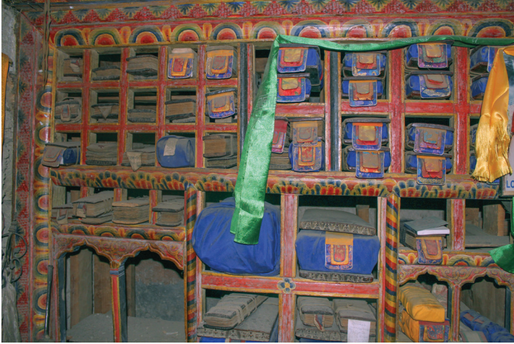
Fig. 1: Private library, general view of shelves, Phijor, 2014; photo by Chandra Gurung.

significance. In large scale raised gold letters, the start of the title zhang zhung skad du , ‘in the language of Zhangzhung’.