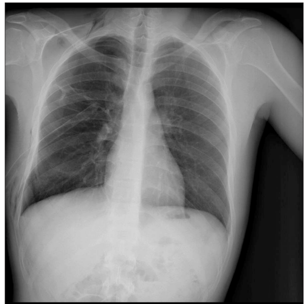
Figure 2. Chest X-ray after chest tube insertion. There is complete resolution of the pneumothorax and the right lung is fully expanded.

tension pneumothorax was obvious on his X-ray (Figure 1). Immediately, the decision to decompress the right pleural cavity with a large-bore needle was made. Later, definite treatment with a chest tube was performed in the right triangle of safety. After that, complete resolution of his symptoms was observed, and his right lung regained full expansion (Figure 2). Then, the patient was admitted to the surgical ward in the hospital. Four days later, he was discharged home free of any symptoms.