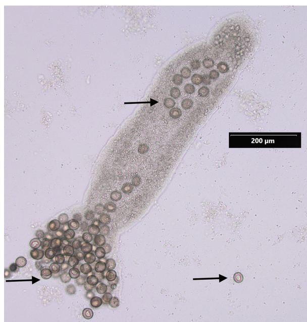
Figure 3 —Gravid proglottid of Echinococcus multilocularis observed on fecal flotation releasing thick walled, radially striated eggs (arrows) each containing a hexacanth larva infective for intermediate hosts: rodents, dogs, and people.

Because both species of Echinococcus are zoonotic, on finding adult cestodes on flotation, the referring veterinarian was immediately notified, and the dog was given 1.5 tablets of Dolpac 10 (praziquantel [50 mg], pyrantel pamoate [144 mg], and oxantel pamoate [559 mg]; Vetoquinol), PO, once daily for 2 days sequentially to kill the adult cestodes, as well as Cerenia (16 mg), PO, once daily for 4 days and teva sucralfate (1 g), once daily for 7 days to manage symptoms. It was also recommended that the owner observe strict hygiene protocols immediately