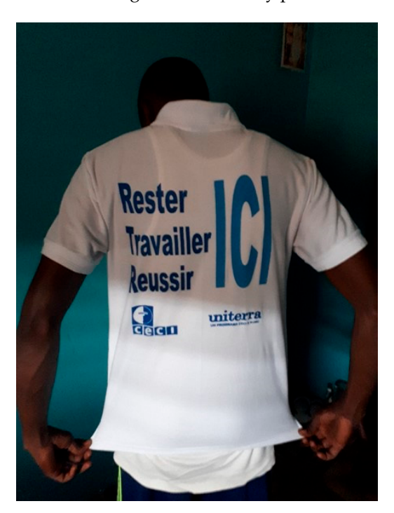
Figure 2. Young man with a T-Shirt distributed by an NGO.

opment programs and foreign anti-migration policies does not only express in reports of international organizations [22], national cooperation agencies [131], and conversations with representatives of NGOs but also manifests quite clearly in theatre pieces like the one described at the beginning of this article or on T-Shirts distributed to young men displaying slogans such as Rester ici, travailler ici, reussir ici (stay here, work here, succeed here) (Figure 2). These discourses also reflect in the design and implementation of the PGS, which aims to guarantee healthy products to consumers and claims to empower producers.