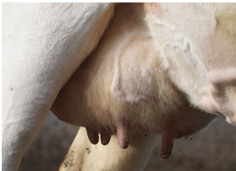
Figure 2. The high metabolic priority of the mammary gland during early lactation imposes metabolic stress on the dairy cow.

nutrient needs, resulting in a NEB with loss of body weight (Figures 3 and 4), and possibly to protein, calcium and other deficiencies. Catabolic stages, like NEB, are compensated by mobilization of body tissue reserves, predominantly adipose tissue (Figure 5). Already at the time of calving a high lipolysis rate expresses high-yielding dairy cows to metabolic stress (Ingvarsen et al., 2003). Consequently, the susceptibility towards metabolic and infectious diseases commences at the very beginning of lactation. Inadequate feeding and overconditioning during the dry period may further predispose cows for periparturient health disorders (Ingvarsen et al.,