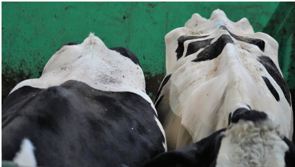
Figure 5. Body reserves are essential to support lactation. However, excessive mobilization of body fat may cause a massive body weight loss and a skinny appearance, expressing a poor body condition. This situation is often associated with health disorders like ketosis and fatty liver.

In high-yielding dairy cows, NEFA are excessively released from body fat, leading to thin cows and low body condition scores after parturition (Figure 5). However, the capacity of the liver to completely oxidize NEFA during the early lactation period is limited. To be more specific, availability of carnitine, capacity of the carnitine shuttle system, and capacity for