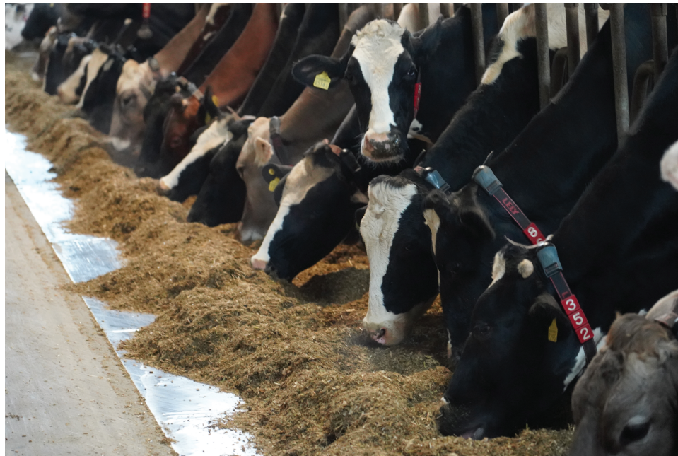
Figure 3. Maximizing feed intake is of major importance in early lactation.

2003). The periparturient period in dairy cows is characterized by an acute systemic inflammatory state due to events related to parturition (e.g., stress, tissue damages of uterus, altered epithelial permeability) (Trevisi et al., 2012). Inflammatory responses occur after the release of signaling molecules following activation of immune cells by stressors, toxins, or invading pathogens. Proinflammatory cytokines like tumor-necrosis factor alpha (TNF- \alpha ), interleukin (IL)-1 \beta , and IL-6 play a key role in stimulating systemic inflammatory responses, including increased body temperature, increased heart rate, or reduced DMI. The acute phase response is one example for effects induced by pro-inflammatory cytokines, where the liver produces positive acute phase proteins (APP) such as haptoglobin, ceruloplasmin, and C-reactive protein