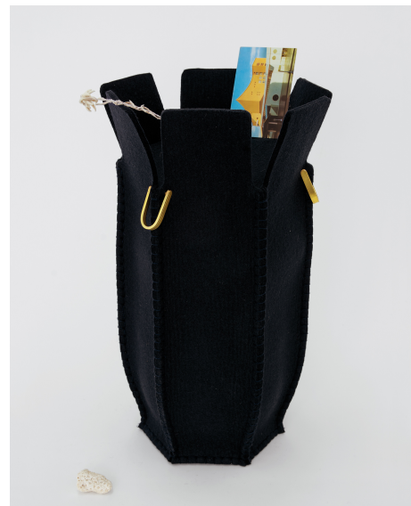
Figure 5. Urn design by the artist Andreas Eschment.

used to talk about death culture. 1 They are parts of a material culture embedded in situated contexts, gaining their meaning through their connection with specific practices (see Hodder, 1998). According to Schatzki (2016), they can be conceived