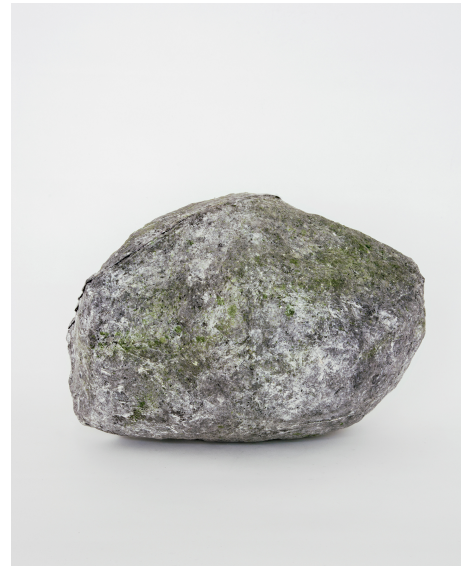
Figure 4. Urn design by the artist Stefanie Bühler.

Before each event, a visual artist or artist collective was asked to design functional urns that took into account their established artistic style and the relevant themes. The resulting urns, which became our centerpieces, were diverse and served as a catalyst for discussing the theoretical and practical aspects of death, burial, the farewell process, and contemporary ritual culture (see Figs. 2–8). The urns are bearers of a death culture, and as Woodward (2019) and Bell and Bell (2012) conclude objects are mediators which can be