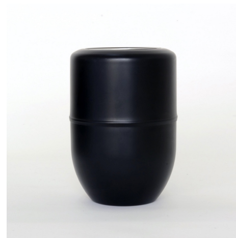
Figure 9. Ash capsule (inner container that is usually placed inside a decorative urn in Germany).

sepulchral culture. Based on their respective professions, the guests – together with the participating artists and the audience – explored the question of how new forms of expression can be developed in the face of death, mourning, and cremation and how changing views on death – also in the context of changing demographic structures, namely demographic aging (see BIB, 2021) – can be taken into account. It was also about the extent to which the art objects, which were designed differently from conventional mass-produced urns (see Fig. 9), could reveal certain underlying conflicts and provoke new cultural practices.