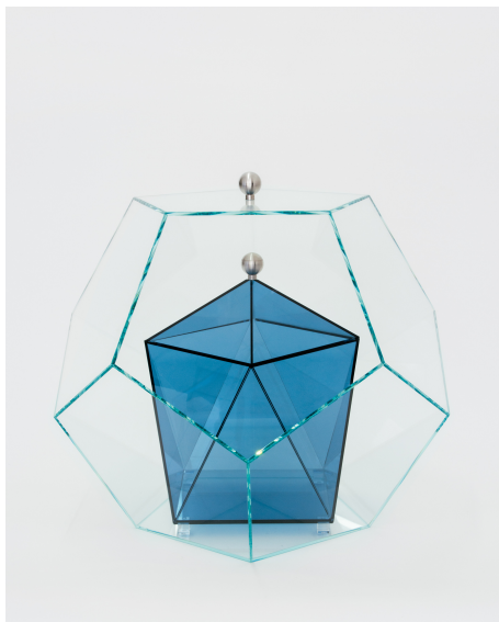
Figure 7. Urn design by the artist Jeuno JE Kim.

as components of material arrangements that are intertwined with practices.