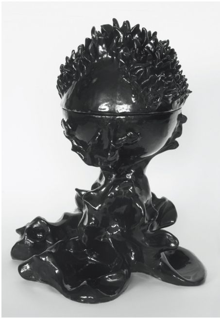
Figure 3. Urn design by the artist Kerstin Stoll.