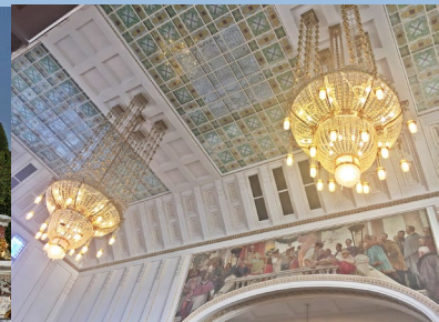
Zagreb 2017 Versailles 2015