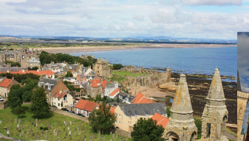
St. Andrews 2001