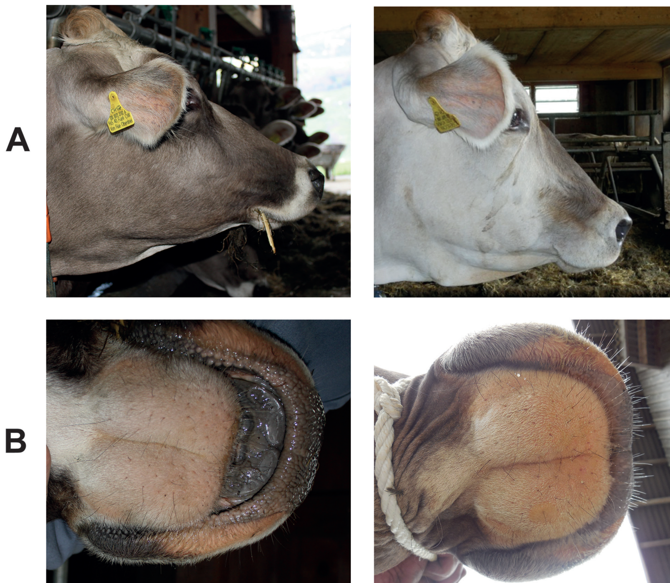
Figure 1. Brachygnathia inferior in Brown Swiss cattle: photos of the head form (A) and the lower jaw (B) of an affected cow (left side) in comparison to an unaffected control animal (right side).

that the brachygnathic facial type was mainly characterized as a shortened mandible, the upper jaw was not significantly involved (Eriksen et al., 2016), and that it could be reproduced in a breeding experiment, suggesting a complex inheritance (Kerkmann et al., 2008). In sheep, an autosomal recessive OBSL1 -related brachygnathia, cardiomegaly and renal hypoplasia syndrome was reported (Shariflou et al., 2013; Woolley et al., 2020). In horses, GWAS revealed an associated region on chromosome 13 for prognathism, where the lower jaw outgrows the upper, resulting in an extended chin and a crossbite (Signer-Hasler et al., 2014). Recently,