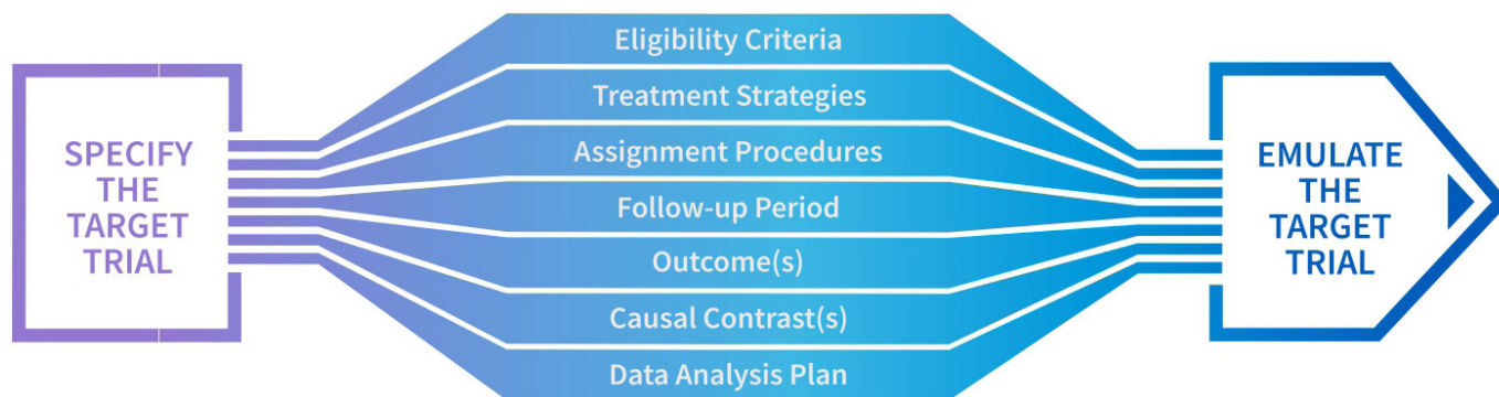
Figure 1 Elements relevant to both the specification and emulation of the target trial described by Hernán and Robins. 3

Application of the target trial framework requires the complete specification of the target trial protocol and its emulation (figure 1). 3 Hernán and Robins 3 provide a template for specifying a target trial and its emulation; however, there is currently no detailed guidance on reporting a study designed to emulate a target trial. Incomplete reporting of these studies limits the ability of clinicians, researchers, patients and other decision-makers to appraise and synthesise findings or interpret them to inform clinical and public health practice and policy. A reporting guideline that expands on the initial target trial emulation template 3 is needed to provide authors with comprehensive recommendations on how to completely and transparently report a study emulating a target trial.