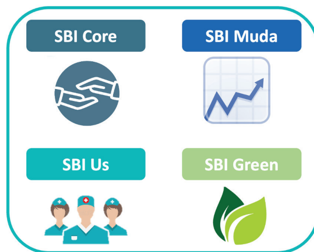
Figure 1. Four Focus areas of the Safe Brain Initiative

However, these outcomes are often monitored sporadically or superficially, neglecting the crucial need for continuous quality enhancement and precision in anaesthesia care. 10 When the assimilation of individual and local patient outcome data is omitted, healthcare professionals forfeit a realistic appraisal of their individual or departmental methodologies' efficacy. Moreover, the lack of structured, anonymous individual feedback deviates from the primary goal of anaesthesia: prioritising patient well-being. Developing comprehensive evaluation and feedback systems to address these issues is imperative, paving the way for effective learning trajectories and promoting sustained quality improvement. 11