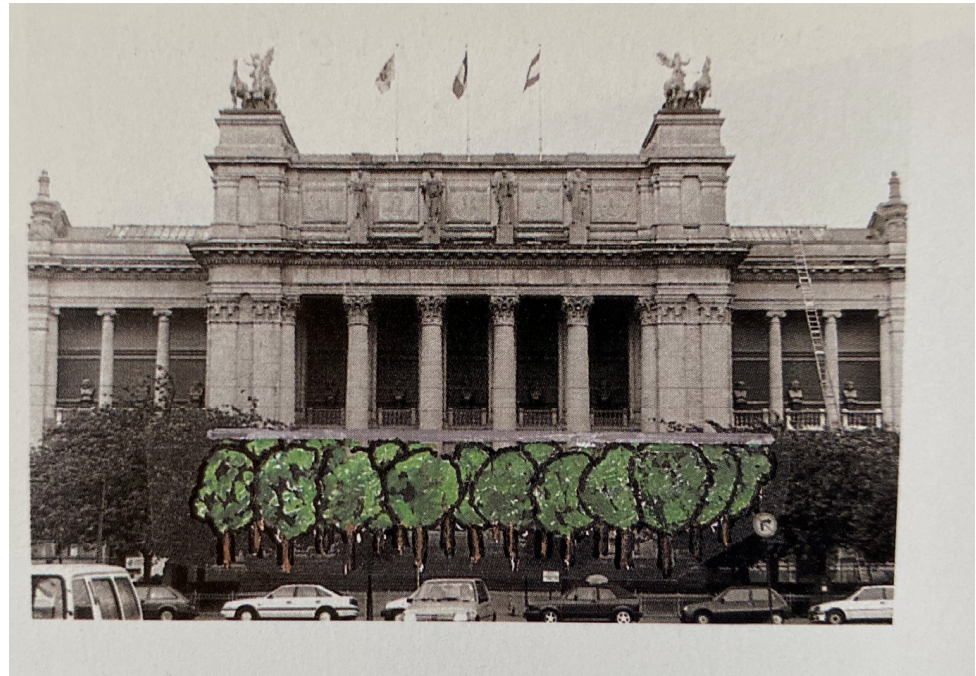
Figure 6. David Lamelas, Initial proposal for the location of the work at the main entrance of the KMSKA (not realized). Drawing on photograph of the Royal Museum of Fine Arts Antwerp reproduced in the exhibition catalogue America, Bride of the Sun, 500 years Latin America and the Low Countries , 1991, KMSKA (Pisters and Vandenbroeck 1991, p. 244).

gallery, and collectors Herman and Nicole Daled. 30 Quand le ciel bas et lourd 's Baudelairean title is just another echo of the intricate ties between Lamelas, Broodthaers and Belgium manifest in the work.