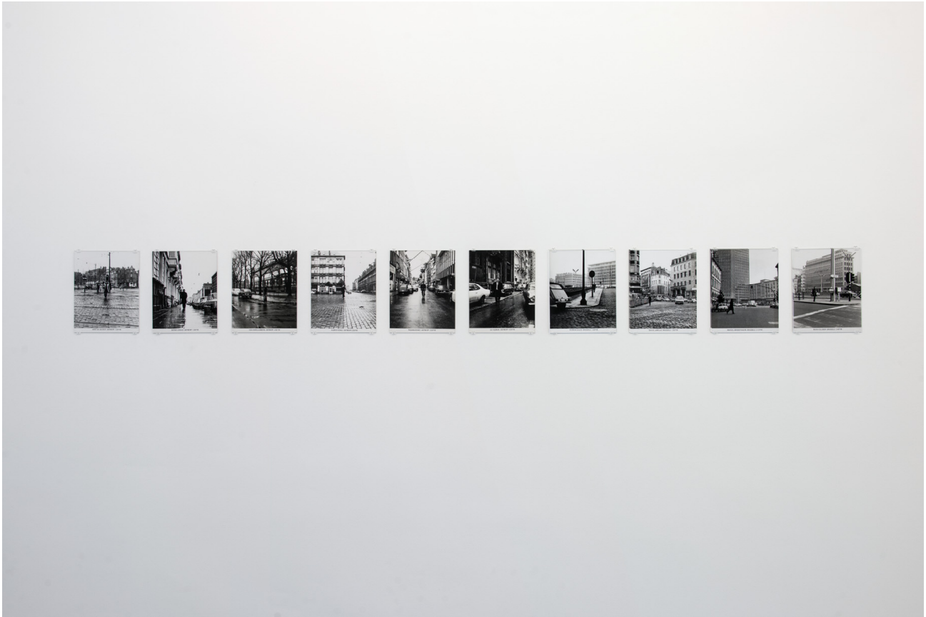
Figure 3. David Lamelas, Antwerp-Brussels (People + Time) , 1969. 10 black and white photographs, 29.7 × 23.6 cm each, 31.5 × 26. × 2 cm (signed and numbered portfolio). Edition of 10 (of 7 produced editions). Installation view, On Kawara, David Lamelas at Jan Mot, Brussels, 2019.

This is especially so when we look at similar time pieces by Lamelas from 1969–1970, where his presence is conspicuously absent: Time as activity (Dusseldorf) (1969), Gente di Milano (1969) and Film 18 Paris IV. 70 (also known as People + Time: Paris ) (1970). 4 In each of these works Lamelas turns the camera towards the city in a documentary manner capturing its people and activity in fragments of time. However, as much as they were meditations on time, they were also profiles of a place. In his words, Lamelas claimed to “appropriate the social and spatial life of the city.” (Lamelas [2016] 2017, p. 167) Antwerp-Brussels is equally “site-specific”, a term used by Lamelas to describe the way it incorporated the physical and social conditions of a particular location as integral to the artwork. The cities of Antwerp and Brussels are not only determined by their geographic and urban structures, but also their social relations and, more specifically, artistic network. Lamelas’ insertion of himself into this configuration reveals the extent to which he identified with these locations and contexts, and even imagined himself as a component of them. The photographic series certainly attests to Lamelas being there and having a place within “Antwerp-Brussels” in the year 1969.