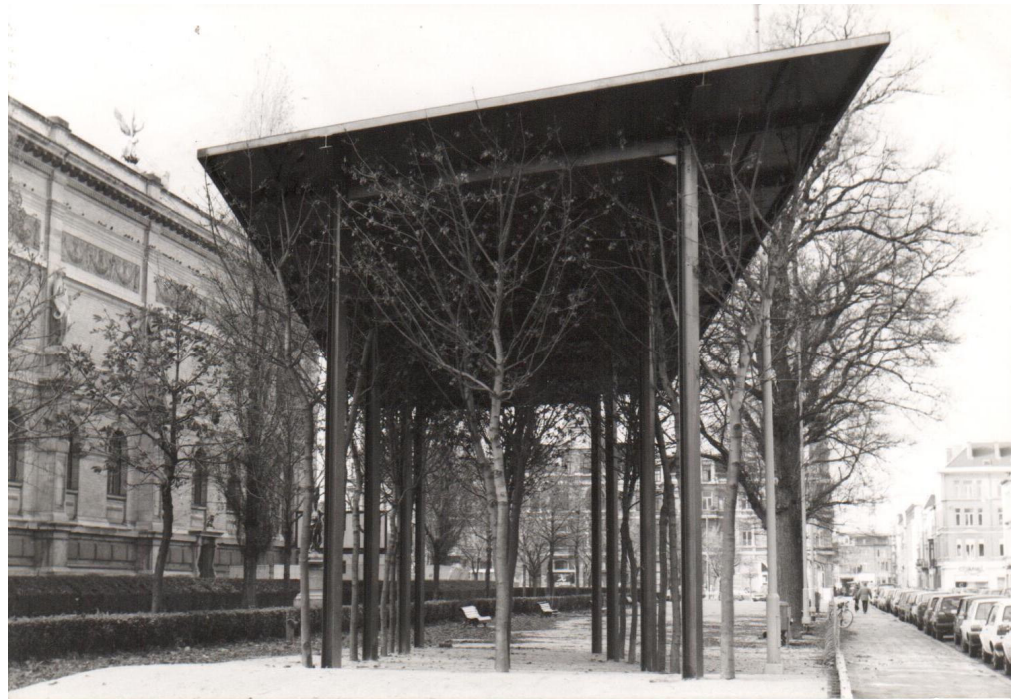
Figure 1. David Lamelas, Quand le ciel bas et lourd ( When the sky is low and heavy ), 1992. Installation consisting of metal sculpture and trees on inclined surface. 6 × 20 × 7.8 m. Collection M HKA, Museum of Contemporary Art Antwerp. Photo: David Lamelas. Courtesy of the artist and Jan Mot, Brussels.

This article uses Lamelas' work as a lens to examine two aspects of contemporary art and history in Flanders. Firstly, it foregrounds the complex, transnational heritage that Lamelas' work presents. The article considers Lamelas' works and exhibitions made in Belgium in the late 1960s and 70s, and again in the early 1990s, exploring his relations to the local artistic avant-garde. Secondly, the text frames Quand le ciel bas et lourd and America: Bride of the Sun within cultural and political developments in Flanders in the early 1990s. The work and show were realized within months of "Black Sunday", the notorious 1991 federal election that marked the rise of the Vlaams Blok (now Vlaams Belang) and, with it, radical-right nationalism in Flanders. Together these sections illuminate how Lamelas' work might challenge monolithic formations of Flemish art.