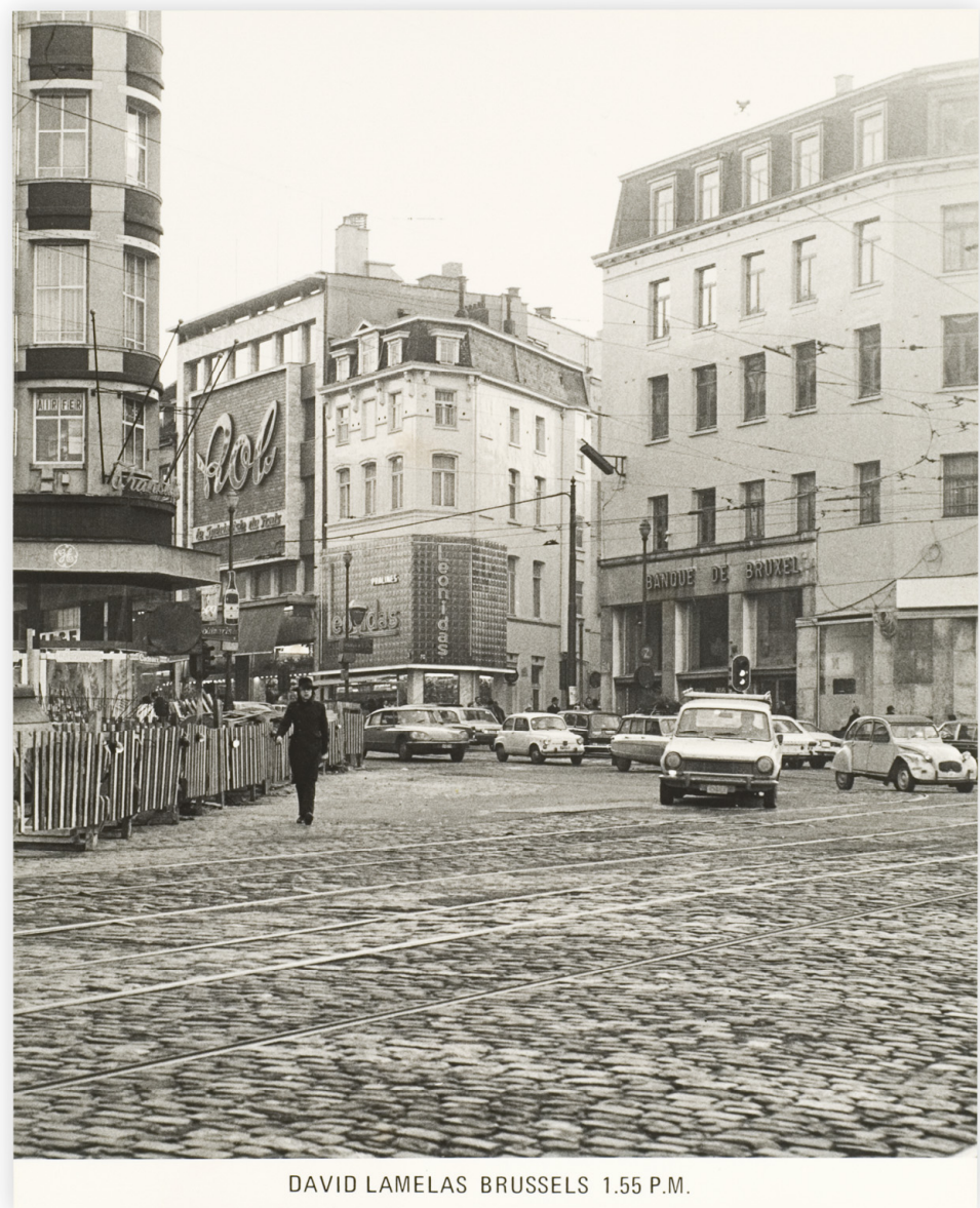
Figure 2. David Lamelas, Antwerp-Brussels (People + Time) , 1969. Black and white photograph, 29.5 × 23.5 cm.

constituted what De Decker called the “Belgium group”, which achieved an international reputation as an active “unconstituted, ephemeral and natural” circle in the contemporary art scene (De Decker and Lohaus 1995, p. 32; Buren 1995, p. 103). In hindsight they are significant for their key role in the development of post-war avant-garde art in Belgium and internationally. Therefore, it is interesting that Lamelas, an artist from Argentina who started studying at St. Martin’s School of Art in London in 1968, would include himself in this series of photographs.