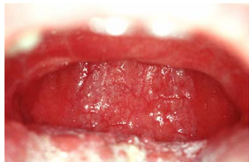
Fig. 3 The postoperative site with wide pharyngeal opening

The age distribution of the patient population in this retrospective long-term evaluation after modified UPPP in patients with habitual or complicated rhonchopathy does not reflect the increasing prevalence of rhonchopathy with age [10, 11]. Younger patients asked for therapy more often than older patients. Self-selection and referral bias must be assumed to be the reason. Male sex is a major risk factor for rhonchopathy, as reported