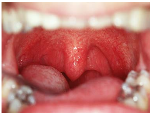
Fig. 2 Typical findings in the soft palate in patients with OSAS: uvular hyperplasia, depressed pillars of fauces with an extremely narrow transition into the rhinopharynx

Eighty-five patients (73%) stated that they would have the operation again even after several years had elapsed.