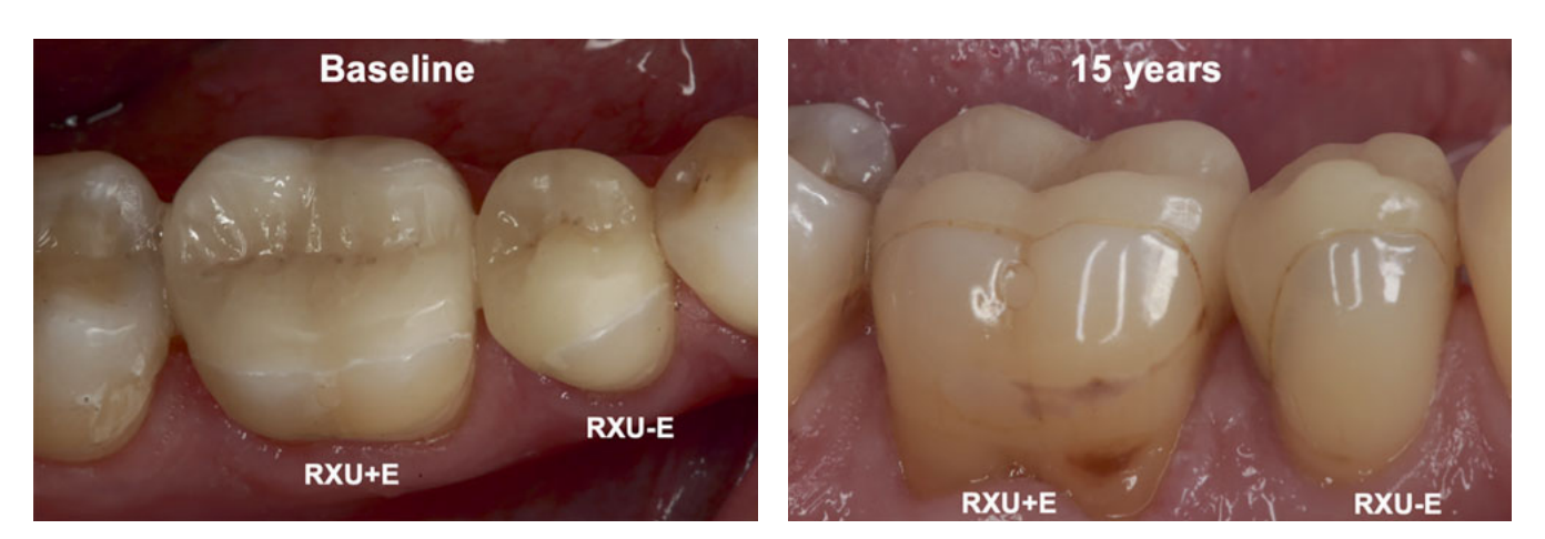
Fig 3 Clinical follow-up. Buccal view of teeth 45 (RXU-E) and 46 (RXU-E) at baseline and at the 15-year follow-up. Restoration 45 (RXU-E) reveals more distinct marginal discoloration involving a greater percentage of margin over time, but was given the same score as 46 using the FDI (score 3) and USPHS criteria (Bravo).