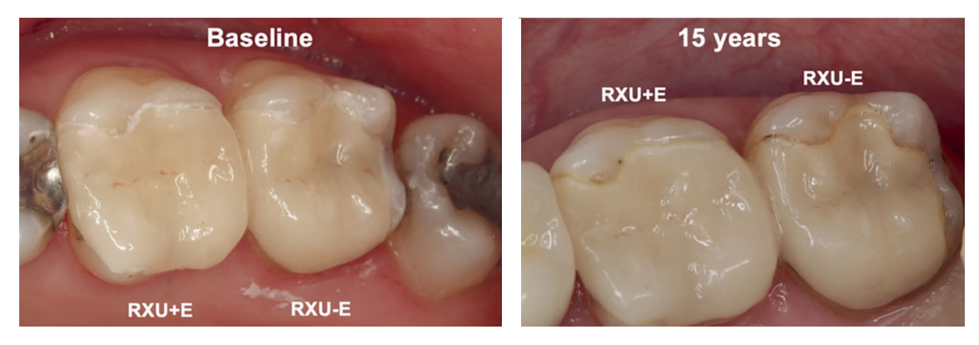
Fig 4 Clinical follow-up. Occlusal view of teeth 26 (RXU+E) and 27 (RXU-E) at baseline and 15 years. For both teeth, steps between the respective restoration and dental hard tissue slight marginal discolorations were visible at the 15-year follow-up. Restoration 27 (RXU-E) reveals more distinct marginal discoloration, rated with the same score as 26 using the FDI (score 3) and USPHS criteria (Bravo). Compared to the baseline examination, tooth 28 was extracted and tooth 25 received a new restoration.

group RXU+E and 42.9% for group RXU-E. The survival rates were significantly different (p=0.004, Fig 2). Eleven PCCs inserted without selective enamel etching had failed during the first three years, in contrast to only 3 PCCs with selective enamel etching. The higher number of debonding failures in the RXU-E group within the first few years of clinical service may possibly be attributed to overdrying of the dentin during try-in and cementation under rubber-dam, which reduces the intrinsic wetness required for the cement reaction of the self-adhesive luting cement.<sup>16</sup> Overdrying might be especially relevant with regard to the slower working pace of the dental undergraduate students compared to experienced practitioners. In contrast, rinsing off the acid in the selective etching procedure may involve the risk of accidentally etching the dentin, but also provides rewetting of the tooth structure prior to placement of the restorations.