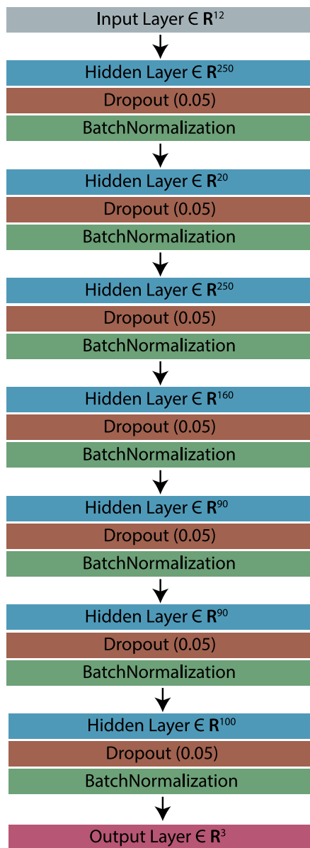
Fig. 1. DLM architecture; input layer with 12 features, 7 hidden layers with 250, 20, 250, 160, 90, 90, and 100 neurons, respectively, followed by a Dropout layer with a 0.05 rate and a batch normalization layer, and an output layer with 3 neurons for the components of the glenohumeral joint force.

kinematics and shoulder muscle EMG, recorded for one subject, to the glenohumeral joint reaction force (De Vries et al., 2016). They reported 0.83–0.98 intraclass correlation coefficients between the MSMs and the