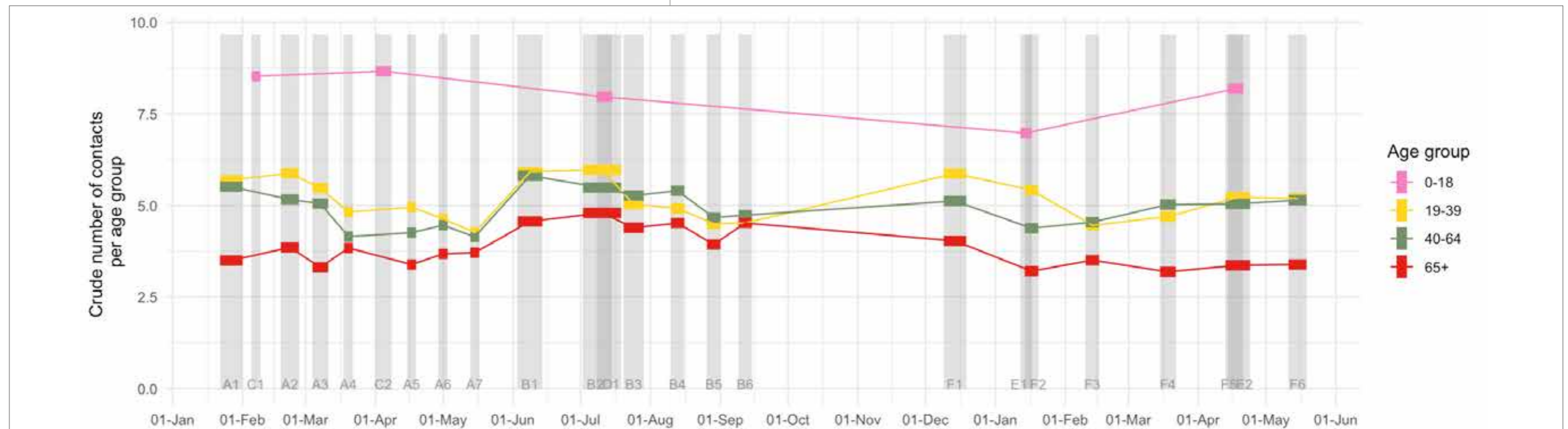
Social contacts per day as reported in the CoMix survey in Switzerland. Numbers represent the average numbers of social contacts per day.