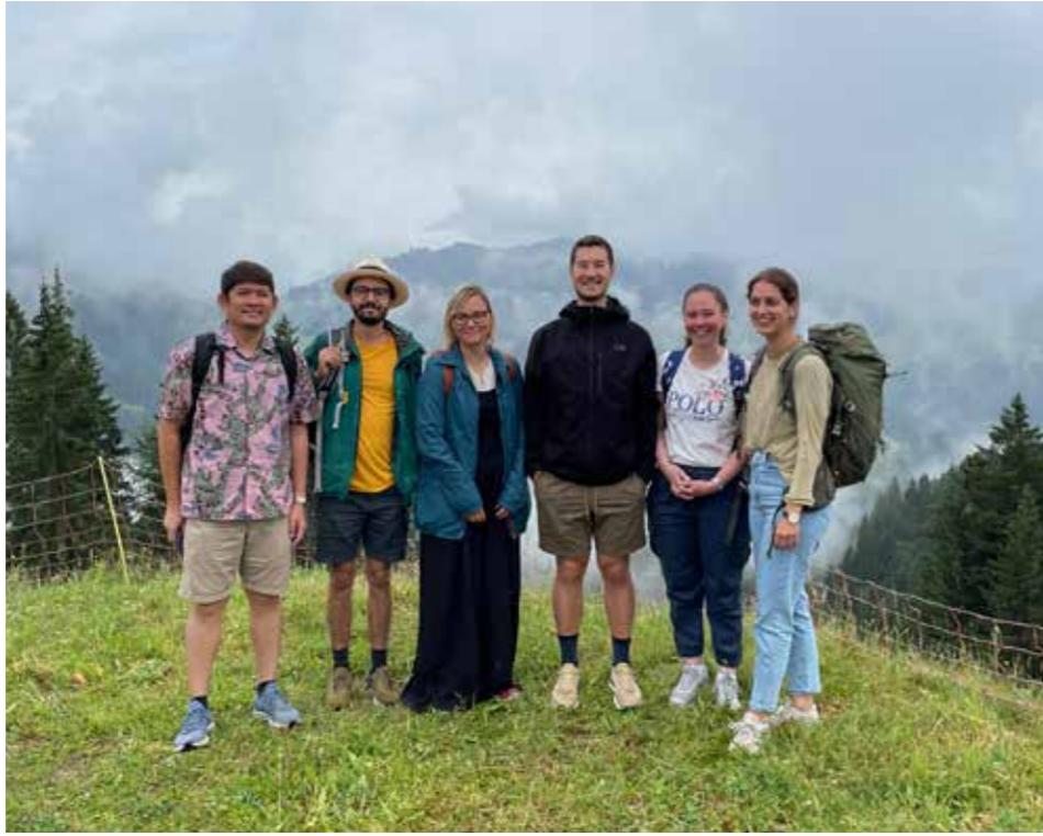
Research group retreat in Eriz, Switzerland in June 2022