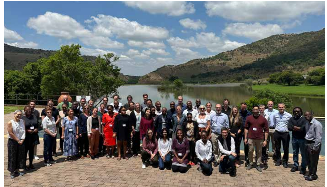
Group photo from the Steering Group meeting of the Southern African region of IeDEA near Johannesburg, South Africa.

Conferences and Events: In November 2022, we met with IeDEA collaborators for our biannual Steering Group Meeting in Muldersdrift, South Africa – near the Cradle of Humankind. Over 50 epidemiologists, clinicians, and health scientists convened during the 3-day meeting to discuss ongoing research and celebrate past achievements. Much of the meeting was dedicated to early career researchers and colleagues from collaborating centers.