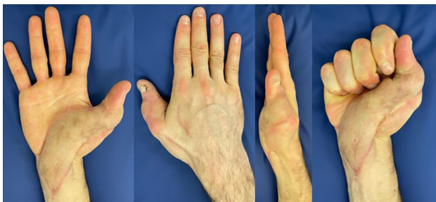
Fig. 2 Outcome after a microvascular gracilis muscle flap including a meshed split thickness skin graft in a 34-year-old male after an infection

gracilis muscle flap, the lateral arm flap is limited due to its short pedicle and its possible size [22]. In 29 patients, Schecker et al. documented the use of the ipsilateral lateral arm free flap with most defects being at the dorsum of the hand, resulting in a success rate of 96.5% [23]. The authors observed tenderness in the region of the lateral epicondyle if