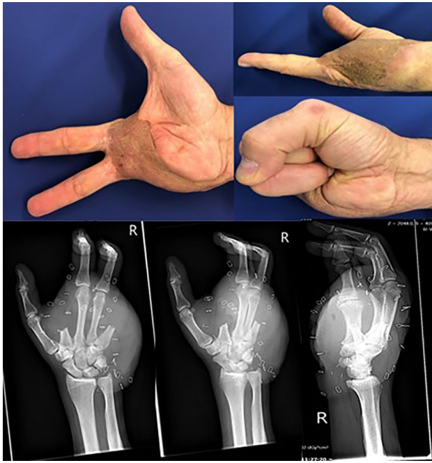
Fig. 3 Outcome of a 56-year-old male after a motorcycle accident and ray amputation of 2nd and 5th digit

of the serratus muscle leading to an easier harvest of the flap and compared outcome parameters with the serratus fascia flap. Patient outcome was equal in both groups in patients with soft tissue defects of the hand and foot [28].