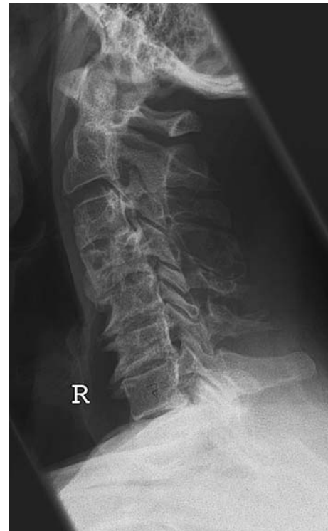
Fig. 5 Lateral view of the cervical region after 6 months still showing expansion and cystic degeneration of the fourth cervical vertebra. In comparison to the earlier radiological findings (Fig. 1) an organisation and consolidation of the fibrous dysplasia can be seen. The degenerative changes still provoke only minor symptoms

Fibrous dysplasia of the skeleton, congenital and similar to hamartomas, is an intraosseous neof ormation of a fibrous tissue, which may be monostotic or polyostotic [3, 6, 9, 10]. Medullary components are replaced by fibroplastic tissue. Skeletal lesions may be associated with skin pigmentation spots. Together with early skeletal maturity and (in females) precocious puberty, this association is known as Albright's syndrome [1, 11]. Other associations may be hyperthyroidism, diabetes mellitus, renal and cardiovascular anomalies. In agreement with its congenital nature, fibrous dysplasia begins during early childhood and is therefore relatively often recognised in younger age [3, 9, 10]. It accounts for about 5–7% of benign bone tumours. No