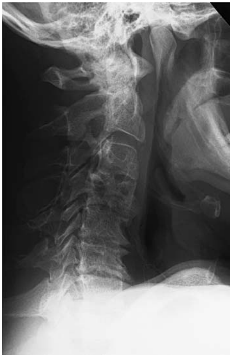
Fig. 1 Lateral view of the cervical spine, taken xy weeks after onset of clinical symptoms. It shows an expansion and cystic degeneration of the fourth cervical vertebra. The severe degenerative changes only provoke minor symptoms

Based on the radiological findings a biopsy of the spinous process was performed and confirmed histopathologically as fibrous dysplasia. Details showed a stroma, being rich in plump fibroblasts with formations of osteoid substance not assuming the aspects of osteoblasts. Bone trabeculae presented in a uniform and woven structure with no atypic cells or mitotic hyperactivity (Fig. 4).