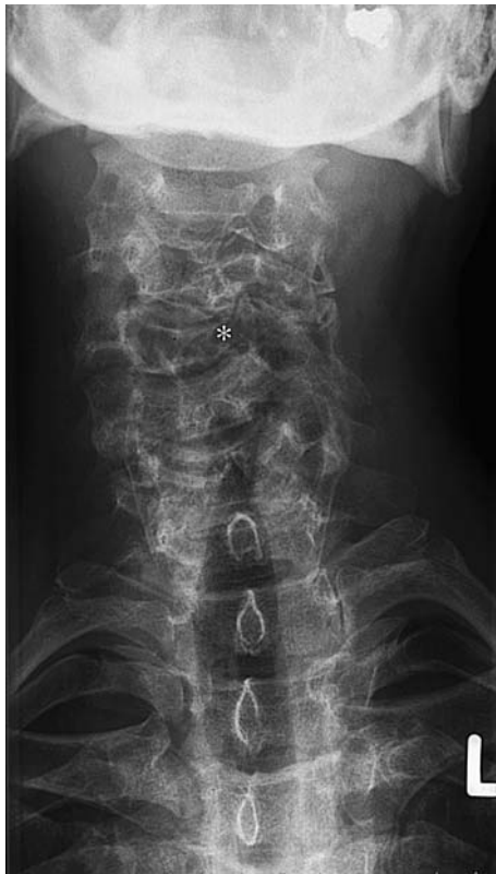
Fig. 6 An a.p. view of the cervical region after 6 months. C4 has collapsed on the left-hand side to a certain extent. (*) Compare Figs. 1 and 5

body and then continuously expands, via the pedicles, into the vertebral lamina and spinous process.