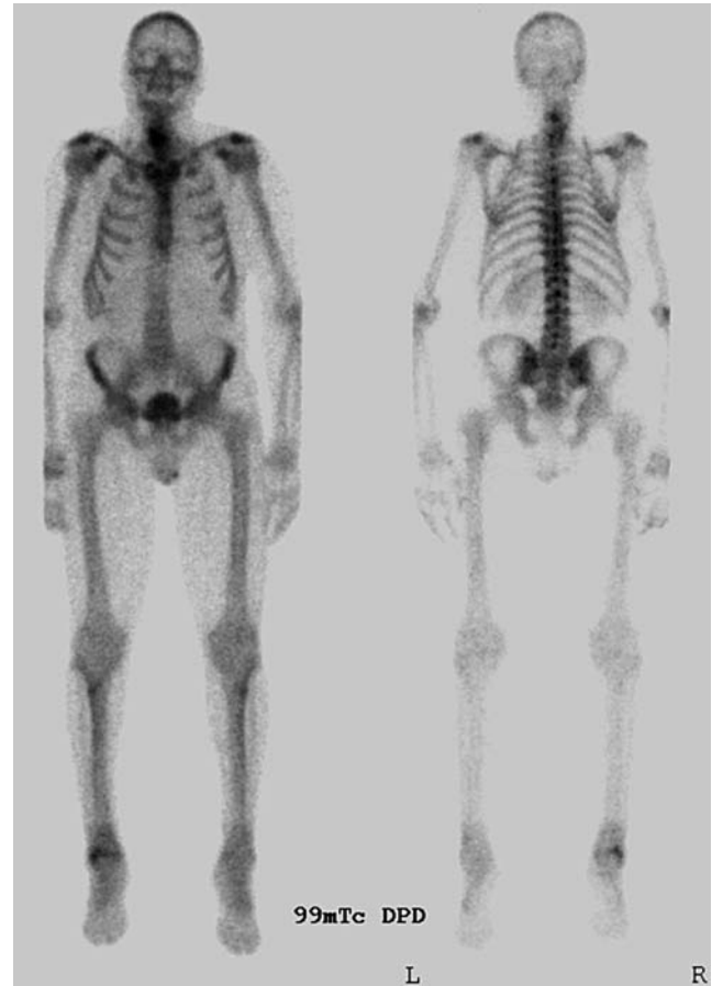
Fig. 3 Skeletal scintigraphy. Note the hot spots in the cervical part of the spine

Due to minor symptoms no surgical treatment was performed or is planned unless in case of increasing pain, an acute instability or neurological symptoms.