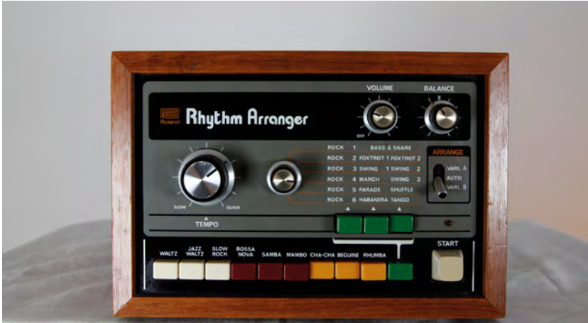
Figure 6: The Roland TR-66 Rhythm Arranger might be regarded as the last, pure preset drum machine produced by the renowned manufacturer Roland. It came in a handy shoebox size. The presets included possible combinations and the arrangement feature can clearly be seen in the figure. All subsequent models provided expanded options for programming and arrangement, until the drum machines of the 1980s brought about true liberation in groove creation via a programmable matrix.

As we have seen, the construction and design of 1970s drum machines offered little to no possibility for individual programming. Instead, musicians had to work with existing patterns, with the particular machine being used dictating the range of options available. As a case study, we can use the Roland TR-66, which includes the most common patterns. The manual offers a transcription of the accessible presets: