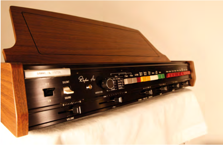
Figure 4: The Bentley Rhythm Ace FR-8L drum machine – with a nearly identical construction to the Roland TR-77 20 and similar to other models – was designed for use by organ, keyboard, or guitar performers: The flatter form made it possible to lay the device on top of the instrument, while the note stand was designed to fold out. Apart from the usual knobs used to select patterns and combinations, individual instruments had their own volume fader, thereby enabling the preset's character to be changed. The start-stop button, located in the top left corner of the panel, was built as a touch-sensitive metal-retainer. Photo: Robert Michler, 2022

Finally, many products from that period were packaged as stand-alone hardware in a manageable size (e.g., shoebox-sized) because their function was to provide accompanying rhythms for musicians performing at gigs and concerts or for practising at home. Performers would choose the pattern that corresponded to a particular song or piece of music; the patterns could also be activated by a footswitch, thereby enabling the musician to keep their hands free and they could play the keyboard, organ, or guitar. In this context, it should be noted that these devices can be seen as easy to handle, which can be explained by affordance theory. Affordance theory states that every technology or technical interfaces provides a more or less user-friendly design, which is ultimately one of the main reasons for the acceptance or rejection of a given technology by an individual. 21