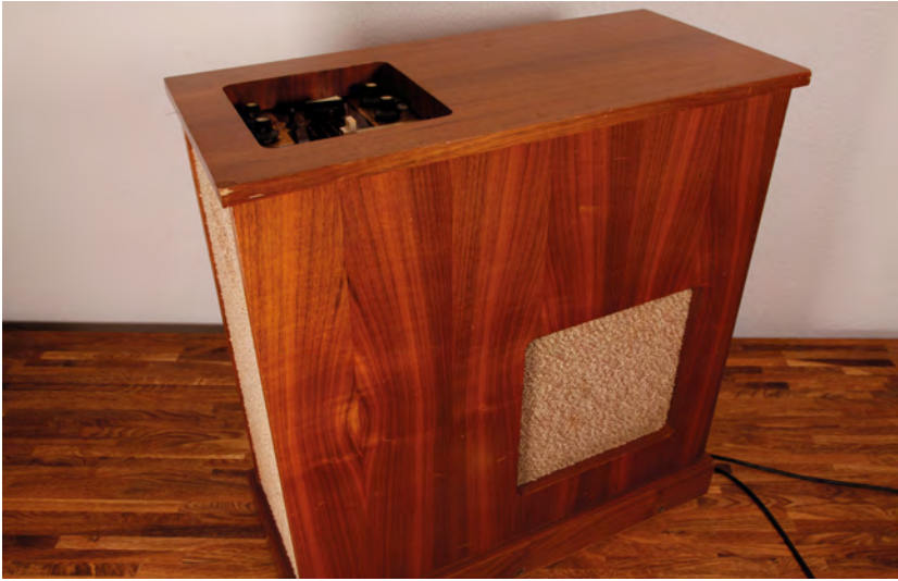
Figure 1: The Wurlitzer Sideman came in a heavy wooden box. It included an integrated amplifier and internal tubes, resulting in a total weight of approximately 40 kg.