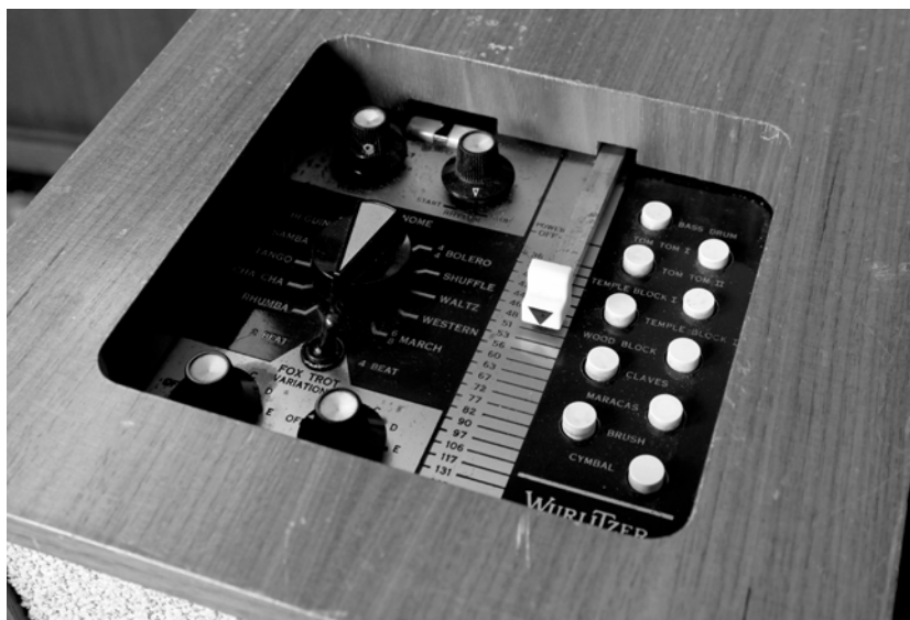
Figure 3: Wurlitzer Sideman. Panel for controlling volume, start-stop, patterns and variations, and tempo, along with buttons to play individual sounds.