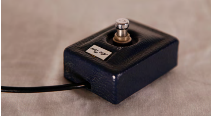
Figure 5: The original footswitch from the company Ace Tone/Roland was used to start and stop the rhythms of the drum machine, thereby keeping the musician's hands free to play the instrument. Nearly all devices from the 1960s and 1970s came with a pre-installed matching jack input.