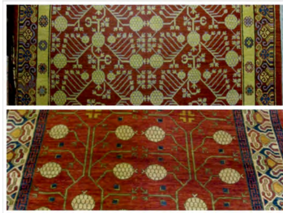
Figure 2: Old (above) and new (below) Khotanese carpets.

Nowadays, people in Khotan don’t make good-quality carpets anymore. But the design is very beautiful, so now they make them in Afghanistan. They copied the design from the old carpets I sold to the Pakistani, and now they bring me new ones. This [pointing at one of those carpets] is made in Afghanistan, but the design is from Khotan. It’s a local design (interview, May 2013).