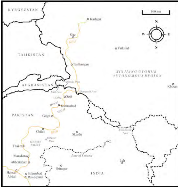
Figure 1: The Karakoram Highway