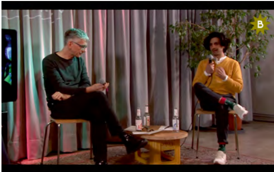
Screenshot from the Bellevue di Monaco YouTube channel