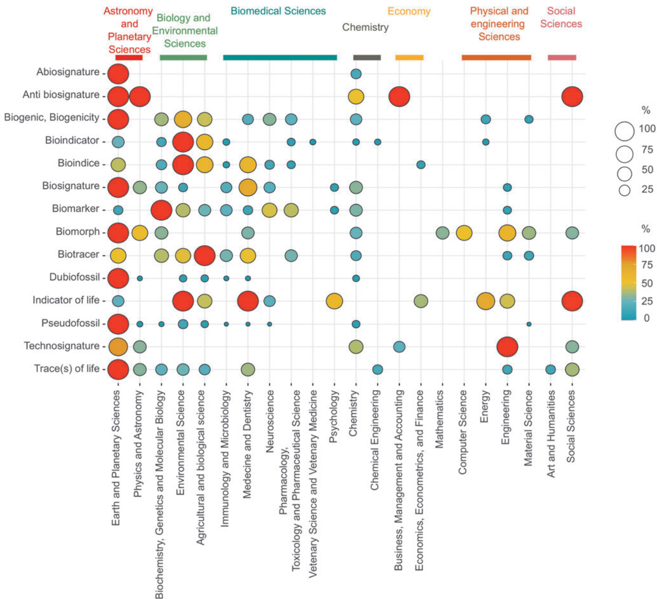
FIG. 2. Usage of “biosignature” and related terms depending on disciplinary context. Standardized number x of articles in each discipline as recorded by Science Direct , where x =number of articles for the keyword per discipline/maximum number of articles for the keyword across all disciplines.

plurality of ways of understanding biosignature-related terms, all conducive of possible misunderstandings.