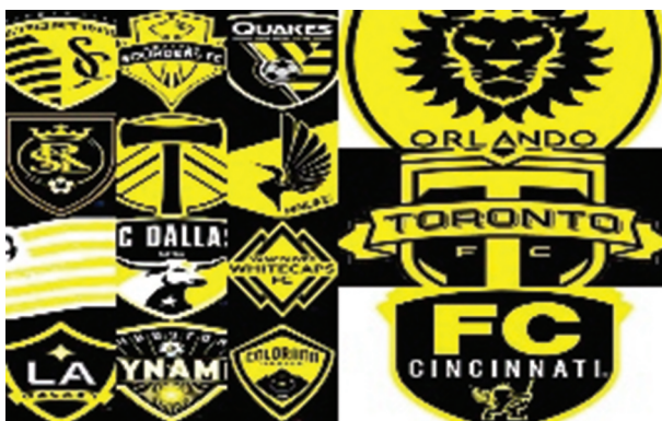
Figure 3. MLS team logos changed to crew colours and shared via Twitter as a show of solidarity.

Framed against the machinations of capitalism and the American sport model and armed with traditional meanings of community, club culture and the romantic language that often typifies resistance, #Savethecrew was able to deliberately craft ‘their’ narrative as the ‘good fight’: ‘Only in the money-grubbing world of American sports is this not good enough’. (See Figure 4 , for the linked image)