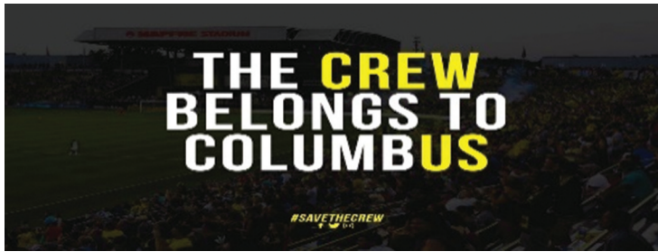
Figure 1. Example images shared on #Savethecrew.