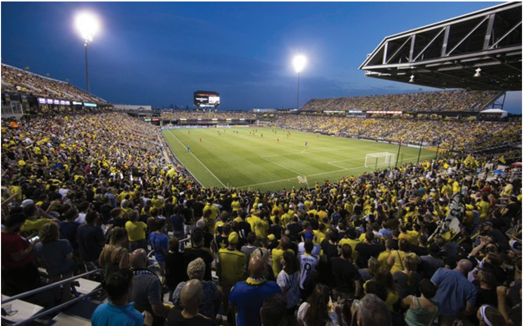
Figure 4. A sell-out crowd at the Mapfre Stadium.

Linked to this image of a sell-out game, one user Tweeted the following message: