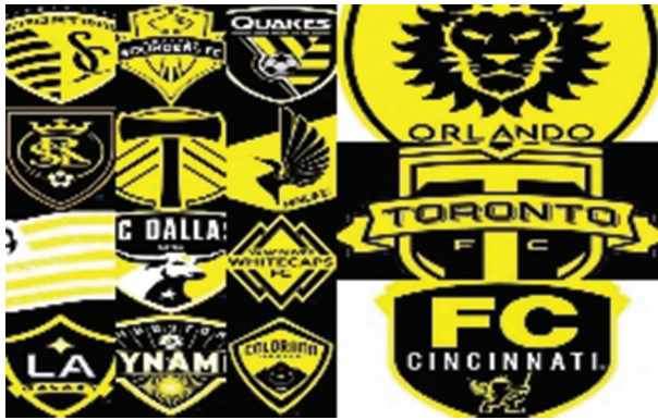
Figure 3. MLS team logos changed to crew colours and shared via Twitter as a show of solidarity.

Framed against the machinations of capitalism and the American sport model and armed with traditional meanings of community, club culture and the romantic language that often typifies resistance, #Savethecrew was able to deliberately craft ‘their’ narrative as the ‘good fight’: ‘Only in the money-grubbing world of American sports is this not good enough’. (See Figure 4 , for the linked image)