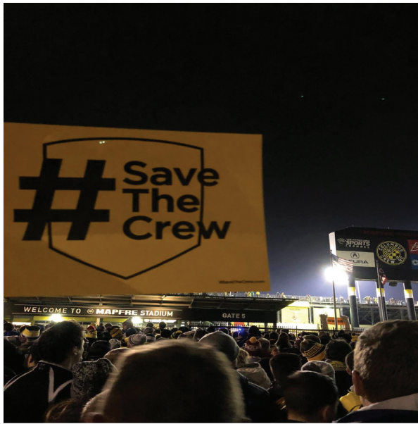
Figure 5. Crowds before a play-off game at the gate and struggling to get inside the stadium before kick-off.

The #SaveTheCrew folks have been saying PSV wasn't being truthful about this whole move. Now it comes out on court documents that PSV wasn't being truthful about this whole move. What else is necessary to get people to believe that the attendance figures aren't true, either?