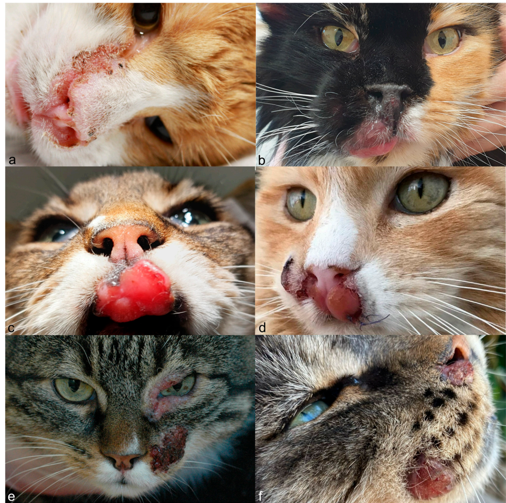
Figure 1. Clinical features of cats with facial spindle cell tumors. Poorly demarcated lesion with crusts, erosions, and ulcerations in cat 1 (a). A single mass in cat 2, which has evolved from erythema and erosion (b), and cat 8 (c). Masses that have evolved from ulcerations and crusts in cat 3 (d). A plaque (periocular) and mass (left cheek) in cat 12 (the third tumor in the left upper lip of this cat is not shown) (e). Two plaques in cat 20 (f). The plaque on the upper lip evolved later into a big mass.

(Figure 3). Ten of the grade 1 tumors (37%) and two of the grade 2 tumors (40%) were histopathologically diagnosed or presumed to be feline sarcoids based on the intimate association of the tumor with the overlying epidermis and the prominent epidermal hyperplasia with the formation of long rete ridges. The other grade 1 and grade 2 tumors were diagnosed as STSs. Two tumors (5.9%) in the study presented moderate to high anisocytosis and anisokaryosis, a high number of mitoses (more than 20 mitoses in a tumor area of 2.37 mm 2 ), and areas of tumor necrosis and were diagnosed as grade 3 STS with amelanotic melanoma as a differential diagnosis (Figure 3).