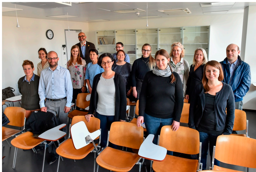
Figure 2. A picture of 15 of the 17 students of the 1st cycle of the Sleep Master during the kick-off event in Bern in October 2017.

The First Master of Advanced Studies (MAS; 2017–2020), according to Bologna's recommendations for higher education, included a Certificate, Diploma, and Master of Advanced Studies (CAS, DAS, and MAS, respectively) with basic, intermediate, and advanced lectures and workshops (e.g., summer and winter schools) in basic, translational and clinical sleep, and circadian science and medicine. Lectures were held online and workshops were scheduled during summers as in-person events in Lugano, Switzerland. A total of 17 students from three continents attended this first cycle of the Sleep Master (Figure 2).