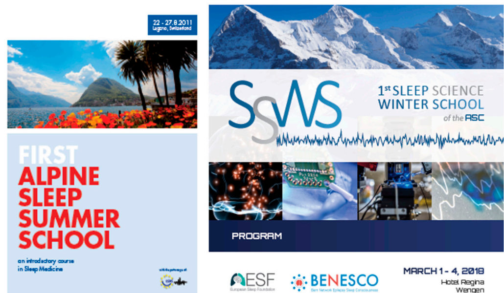
Figure 1. The flyers of the 1st Alpine Sleep Summer (2011) and the 1st Sleep Science Winter schools (2018), which created the basis for the foundation of the MAS in sleep medicine in 2017.

The creation of the MAS by the Universities of Bern and Svizzera Italiana (USI) was preceded by the organization of educational events including the Bernese Sleep–Wake Days (since 1997), three International Narcolepsy Meetings (1998, 2004, 2009), and the First Sleep Alpine Summer School (2011, lasting for 6 days) [13] (Figure 1).