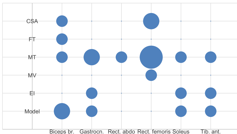
Figure 2 Bubble chart presenting the number of validity tests performed for each muscle and muscle parameter* (n=24).

Notes: *The area of the bubble represents the number of validity tests that were performed for the type of muscle and muscle parameter, respectively. The size of the following bubble equals n = 1 validity test.