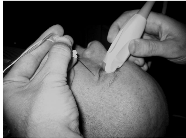
Fig 1 The curved array ultrasound transducer is placed at the upper and inner quadrant of the orbita. The needle penetrates the skin at the lower outer quadrant in line to the transducer. (Picture taken on a model instead of a cadaver).

Two examiners (R.G. and U. E.) performed ultrasound-guided retrobulbar blockade. In each cadaver, the right and the left eyes were randomly assigned to the examiners. The ultrasound device used was a SonoSite® MicroMaxx (SonoSite Inc., Bothell, WA, USA) with an 11 MHz curved array transducer (C11e, 8–5 MHz, 11 mm broadband curved array, SonoSite Inc.). The ultrasound transducer was placed in the upper and inner quadrant of the orbita (Fig. 1) and transverse sonogram obtained showing the bulbus and the optic nerve (Fig. 2).