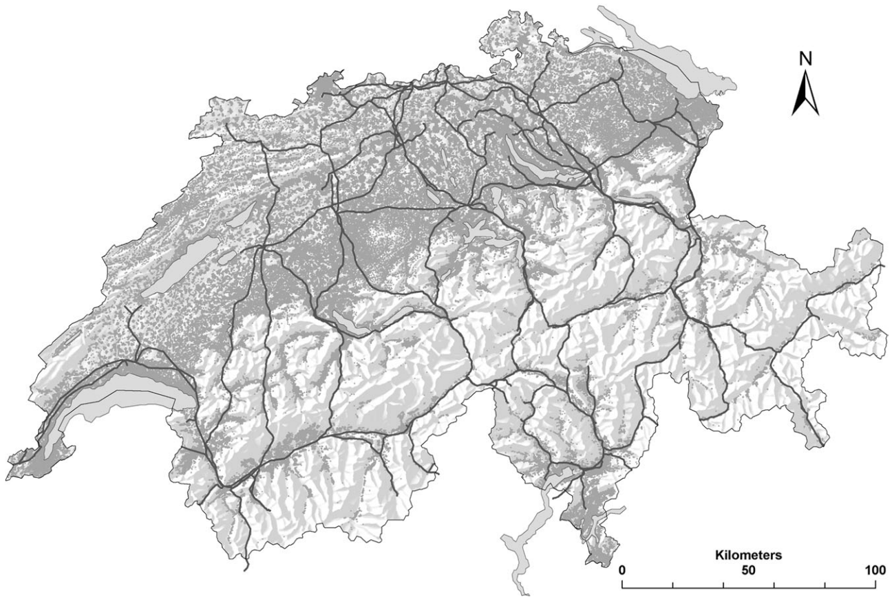
Figure 1. Power lines and buildings in Switzerland. Data sources: Federal Inspectorate for Heavy Current Installations, Fehraltdorf (power lines); Register of Buildings and Dwellings, Federal Statistical Office, Neuchâtel (building coordinates); and Federal Office of Topography swisstopo, Wabern (background map of Switzerland).

We used age as the underlying timescale in our models. All models were adjusted for sex; educational level (compulsory education, secondary level, and tertiary level); highest reported occupational attainment by code (4 levels extracted from the International Standard Classification of Occupations of 1988—1) legislators, senior officials, managers, and professionals, 2) technicians and associate professionals, clerks, service workers, and shop and market sales workers, 3) skilled agricultural and fishery workers, craft and related trades workers, plant, machine operators, and assemblers, and elementary occupations, and 4) no occupation reported); civil status (single, married, divorced, widowed); urbanization category (city, agglomeration, rural municipality); and language region (German, French, Italian). We also included the number of apartments per building into the model, a potential risk factor for magnetic field exposure due to indoor wiring (8).