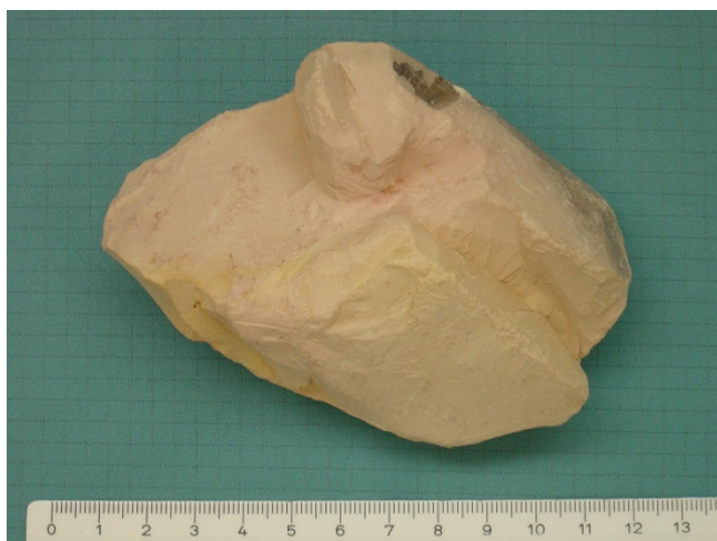
Figure 1 The stone consumed by the patient. Scale in centimetres.

During a follow-up visit and further explicit questioning about particular eating habits, the patient reluctantly disclosed an almost daily consumption of 'a friable stone' over more than a decade. She reported having developed a particularly strong craving for such stones, of which she would suck on small pieces until these completely dissolved. She had acquired this habit 15 years ago in her home country Cameroon, where consumption of stones is common. To characterise the chalky stone (Figure 1), we contacted our geosciences department. X-ray diffraction measurements confirmed that the substance was essentially composed of kaolinite with traces of quartz (Figure 2). After cessation of kaolinite ingestion, we administered intravenous iron replacement therapy (total of 1000 mg) and the anaemia was corrected within 1 month (Hb 125 g/litre, MCV 79.4 fl, MCHC 333 g/litre,