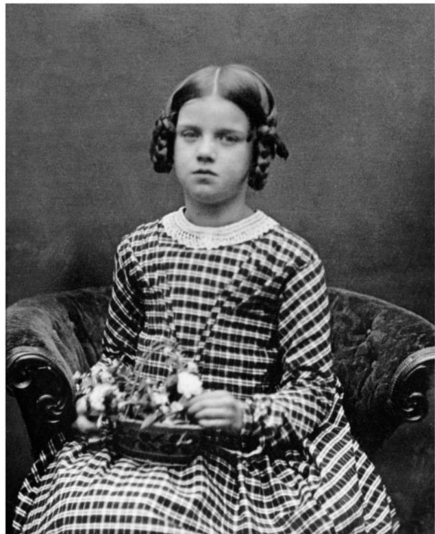
Photograph 1 Daguerreotype photograph of Anne Elizabeth ('Annie') Darwin 1849. Annie Darwin died in 1851, probably of tuberculosis.

Indeed, Annie died after a lingering illness, most likely of tuberculosis (TB) caused by Mycobacterium tuberculosis , 6 and not of the consequences of a high coefficient of inbreeding (the F coefficient that features in one commentary 2 ). Of note, although