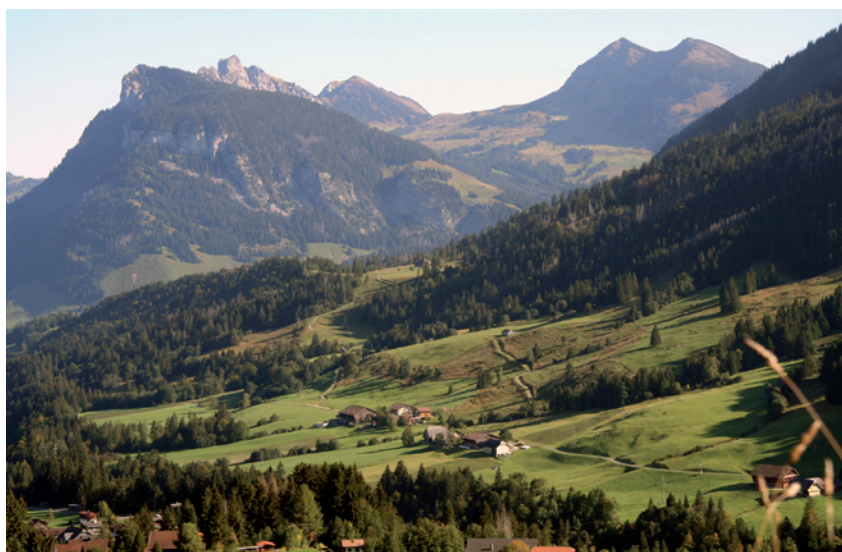
Landscape section Hagleren of the national protected moorland landscape Glaubenberg in UNESCO Biosphere Reserve Entlebuch (UBE): the moorland areas are the major landscape feature of the UBE and at the same time a cultural landscape of diverse structures. Its ecological values emerged through gentle forms of land use and forestry

The non-material significance of moorland landscapes is related to mental well-being: they serve as sources of inspiration and knowledge and also play an important emotional and aesthetic role.