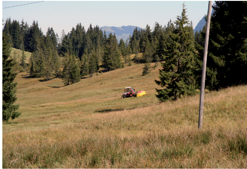
Extensive agricultural use of low-moor bogs in the moorland area Habkern / Sörenberg in the UBE: in addition to traditional forms of use as pastures, gentle modern forms of use such as mechanical litter cutting are permitted to maintain the diversity of the moorland landscapes

National regulations are inadequate for implementing the conservation objectives for the moorland landscapes. The three political-administrative levels in Switzerland – federal, cantonal and communal – share the responsibility for realizing the overall objective (“multi-level protection of moorland landscape”). To