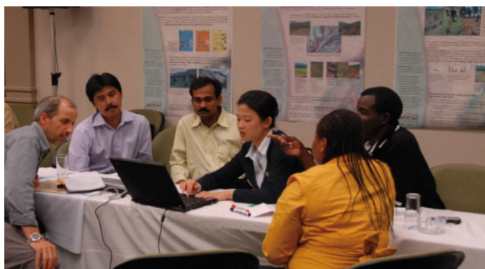
Impressions from the annual WOCAT workshop and steering meeting.

Investment in knowledge management is needed: SLM is complex - and “best-bet” solutions are needed.