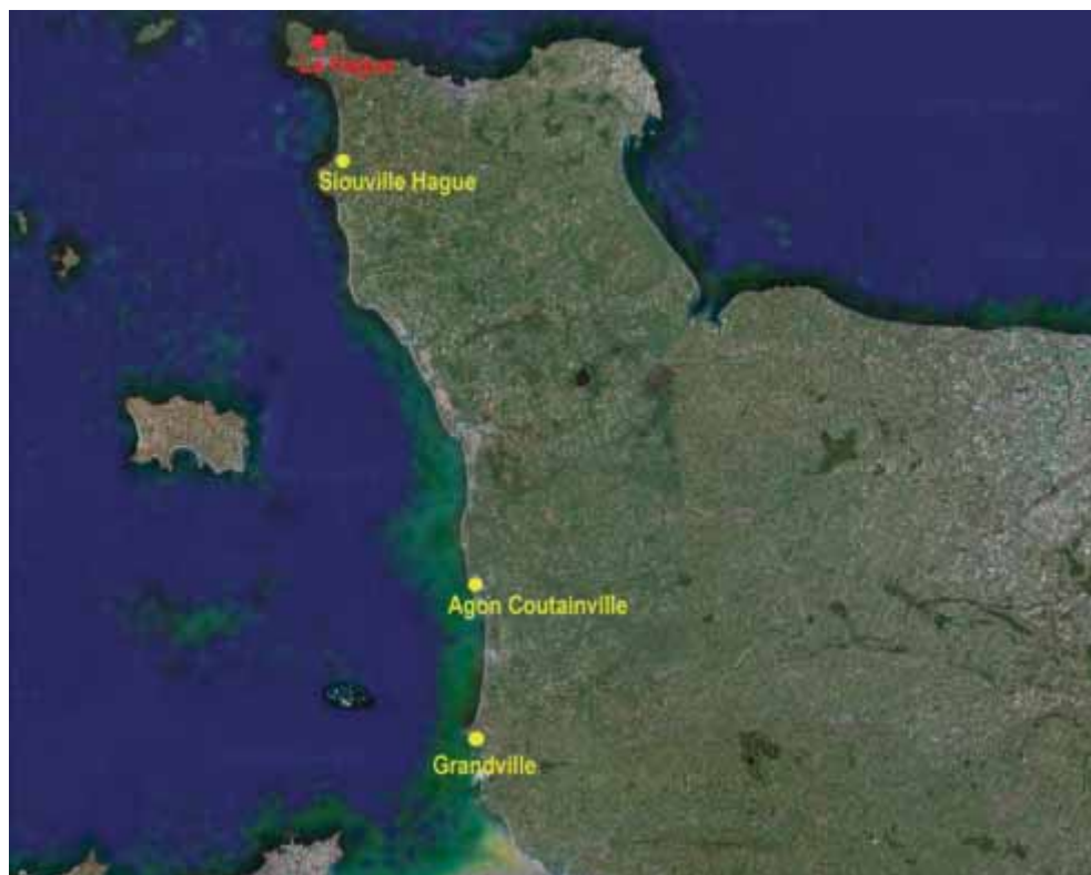
Fig. 1. Sampling sites for seaweed (google map).