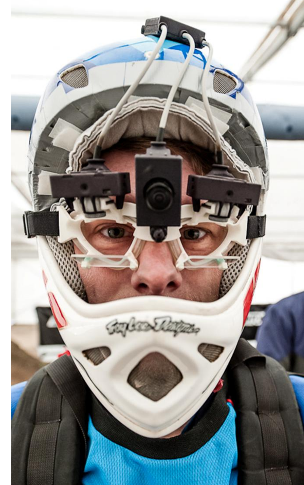
Fig. 2 EyeSeeCam.

Condition effects seem less profound, with equal number of fixations through the curve (Control condition: M = 5.06, SD = 2.45 ; Vibration condition: M = 5.13, SD = 0.66 ).