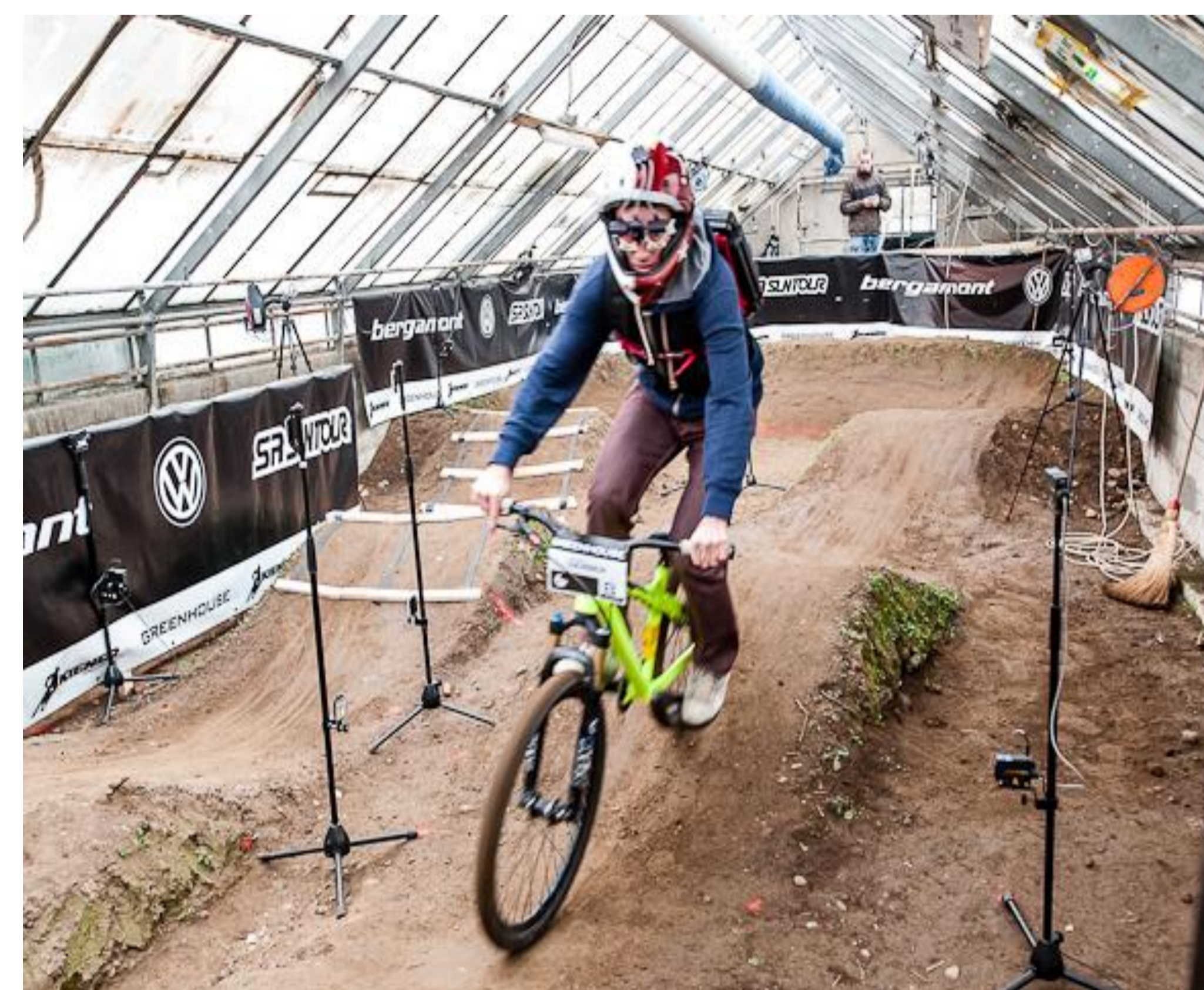
Fig. 1 Experimental set-up.