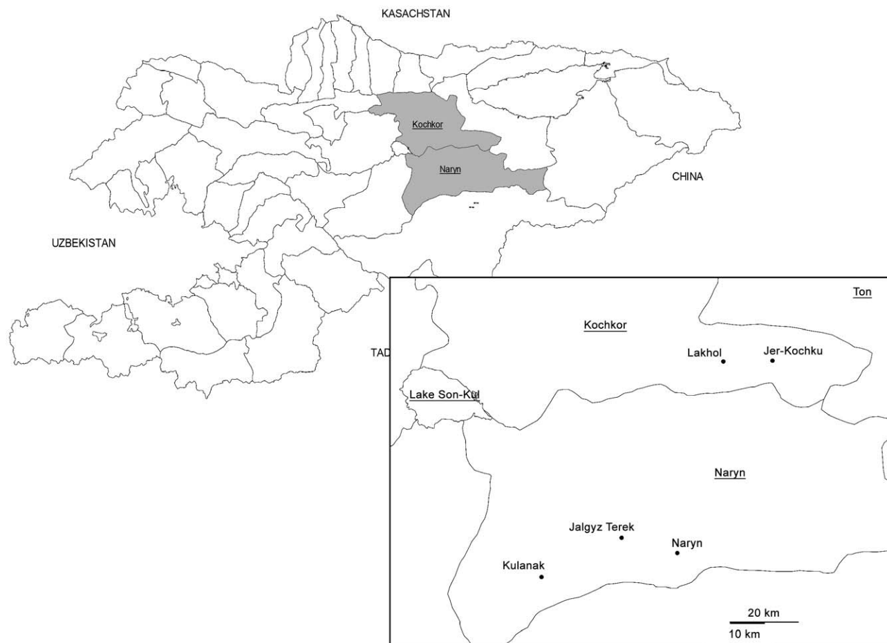
Figure 1. Geographic location of the Naryn oblast and the villages from where Brucella melitensis was isolated.

Livestock systems and management of herds from which B. melitensis were isolated varied between owners. Livestock owners kept cattle and small ruminants together and practiced seasonal transhumance to high-altitude pastures. They sometimes also kept entrusted animals from several owners and traded actively animals. During the lambing seasons 2009 and 2010 in Naryn, 125 aborted fetuses (112 from sheep and 13 from cattle) were collected in the 4 villages and the city of Naryn (Figure 1). The rate of isolation for sheep was 8.9% and for cattle is 15% but the difference is not statistically significant. Urease and oxidase positive cultures were selected and 17 out of 23 isolates were confirmed B. melitensis by MALDI-ToF MS and MLVA-16 (Figure 2). The dendrogram is based on the MLVA-16 genotyping assay showing the relationship of the 15 sheep and two cattle isolates of Brucella melitensis . For each locus showing variability, the number of tandem repeats is presented. Additional information is provided on the type of sample, the local strain designation, the serial number of the animal owner and the name of the village in Naryn oblast. Numbers in brackets indicate repeated isolates from the same animal. Isolates not indicated as primary were frozen prior to cultivation. Of the 17 isolates, 15 were isolated from sheep and two from cattle. All strains were susceptible to the