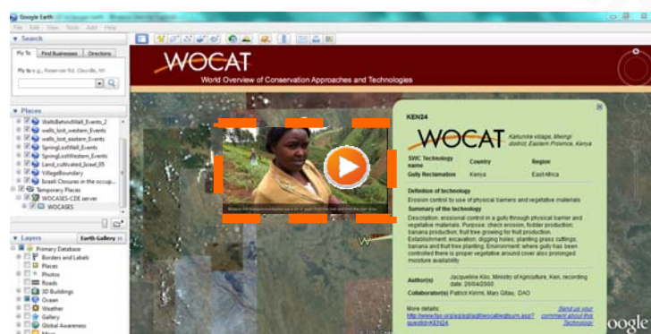
Fig. 2: Audiovisual messages in the WOCAT Google Earth application

In order to guarantee a wide distribution of the video products they will be embedded in and linked to the websites of the international NGO Access Agriculture ( www.accessagriculture.org ) and the Water Channel ( www.thewaterchannel.tv ) (see Fig. 1). In addition, videos are directly linked with the WOCAT Google Earth application, an open access tool that everyone can download. Currently the WOCAT Google Earth application user can click on a WOCAT icon in Google Earth and a window with a summary of a technology and approach appears. These summaries are coupled with video clips facilitating both reading about an SLM technology and approach as well as learning directly from land users through audio-visual messages (Fig. 2).