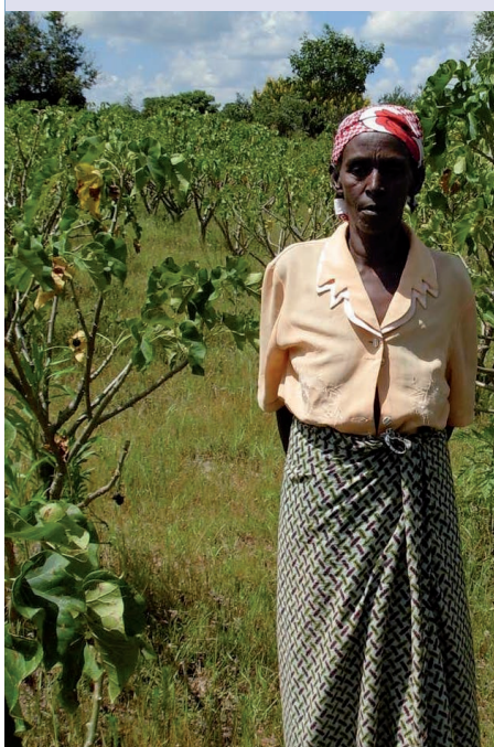
Figure 2: A farmer in her jatropha field in Mpanda (Tanzania). It was estimated that she could have earned around six times more income from the same field by growing and selling maize.

In Engaruka (Tanzania), farmers established around 110 kilometres of jatropha hedgerows around their plots (Figure 3); hence, they did not divert land from food production. The productivity of these hedges was estimated at 0.7 kg of seeds per meter. Selling these seeds at current market prices would earn each household an average additional income of USD60 per year, which would help improve food security (Lyimo 2010).