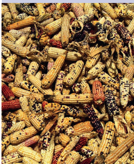
Figure 1: Food security is not only determined by availability of food, but also by other factors, such as access to food, security, livelihood strategies, farming systems, etc.