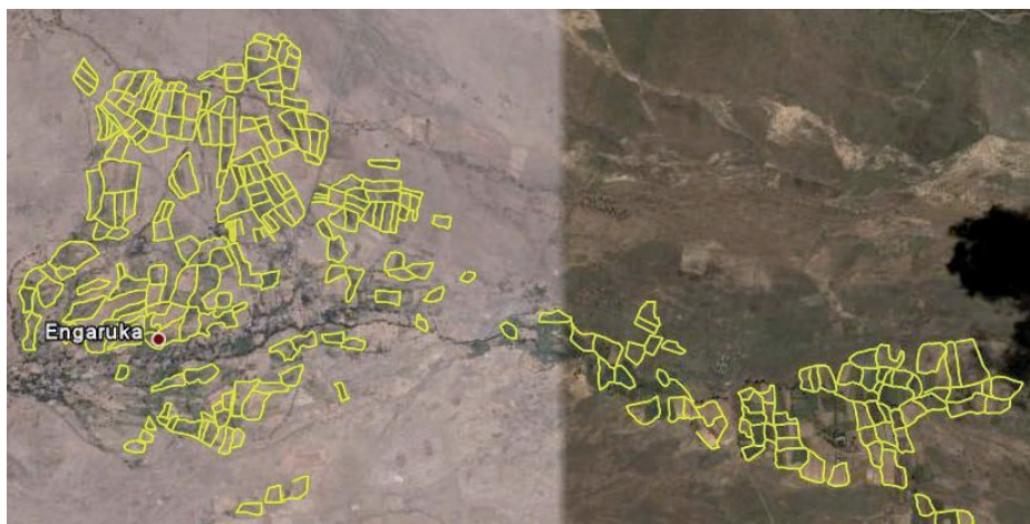
Figure 3: Jatropha hedges (yellow lines) around farm plots in Engaruka (Tanzania). Jatropha can provide opportunities for additional income and therefore improve food security. (Lyimo 2010)

food for a nutritious diet. Thus, poverty and lack of income-generating opportunities are also strong drivers of food insecurity. Biofuels can have both positive and negative impacts on food security , increasing opportunities for income and rural growth but reducing local food production.