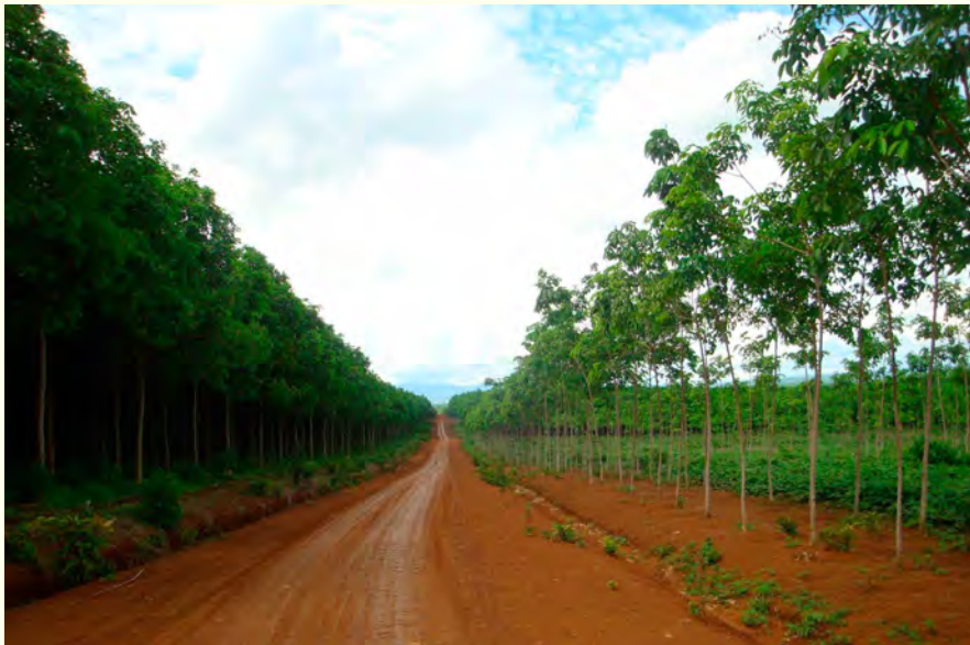
Rubber plantation in Laos.

Land acquisitions may be monitored using an interactive, “crowd-sourced” web-based knowledge platform. The knowledge platform supports efforts to strengthen multi-stakeholder and evidence-based decision-making processes regarding the sale and use of land.