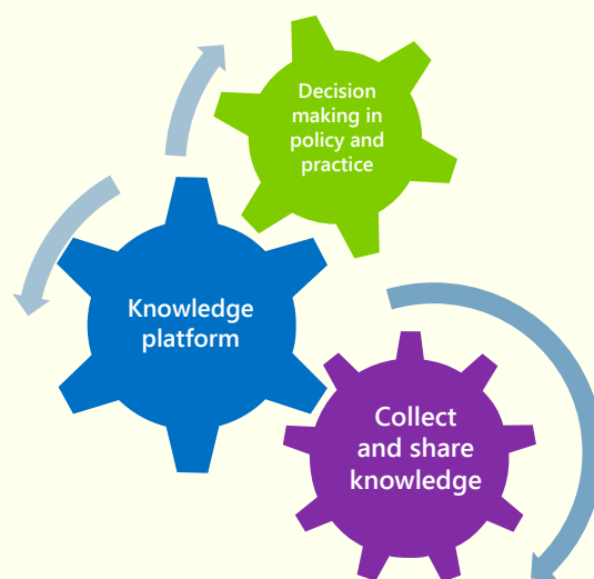
Land Observatory Processes

www.landobservatory.org http://landportal.info/topic/land-observatory http://landportal.info/landmatrix