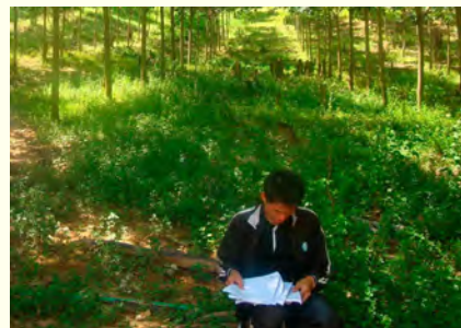
Researcher in rubber plantation, Laos.

Local populations' access to land is threatened by large commercial investments stemming from domestic and foreign interests. Often, land deals are not transparent and local stakeholders have little or no means of participating in decision-making.