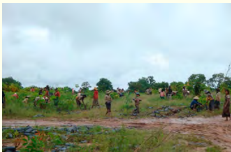
New rubber plantation in Southern Laos.