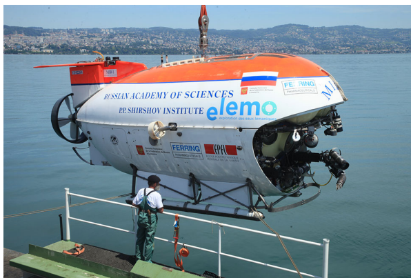
Fig. 1 MIR submersible from the PP Shirshov Institute of Oceanography, Moscow, of the Russian Academy of Sciences, ready to be launched in Vidy Bay, Lake Geneva, Switzerland. The submersible is driven by the large black propeller ( left ) and its 3-D trajectory is controlled by two small white propellers ( center one on each side). Details of the equipment visible in front of the submersible ( right ) are given in Fig. 3.

The research carried out within the elemo project followed the concept “from source-to sink”, i.e., the trajectories of waters entering the lake and the fate of their constituents, such as pollutants, are tracked through the lake. Therefore, detailed field studies were performed in the “source” areas of the Rhône River delta and Vidy Bay (Fig. 2), where allochthonous material and anthropogenic pollutants are brought into the lake. In particular, the MIR submersibles permitted an unprecedented opportunity to study the complex subaquatic canyon structures of the Rhône River delta, including sedimentation, erosion, and